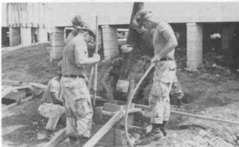
(Top left) The Alfa Company asphalt crew takes a rest at the Fleet Hospital Hardstand. (Left) Crew members pump concrete into footer forms at the Inarajan School. (Above) Concrete is placed in footers for the DTS Pre-Engineered building.