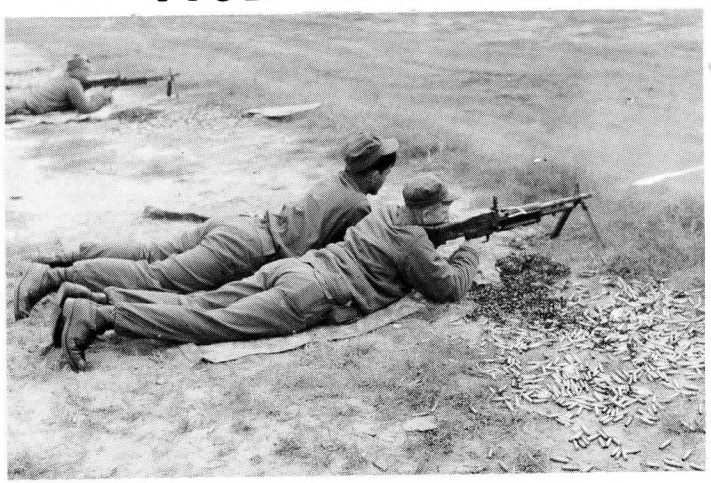
Extensive training covering all aspects of the M-60 Machine Gun was given on the Lejeune range, and in the classroom.