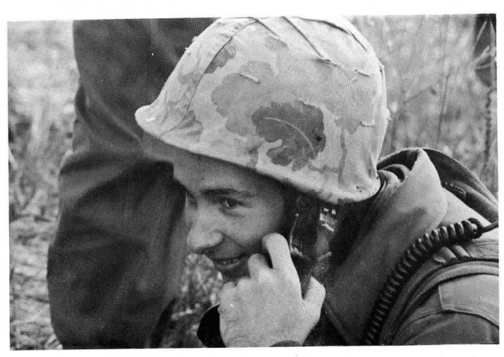
SN ERARDY provides a link in the important communications between companies during the tactics.