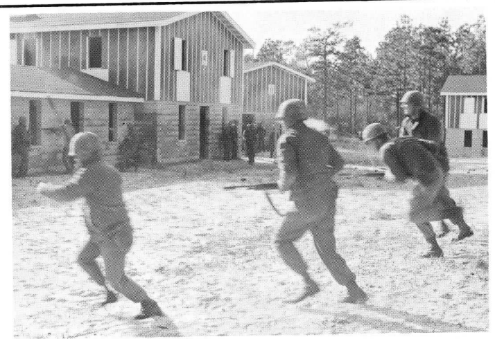
Combat Town training taught squads the tactics of assualt and capture.