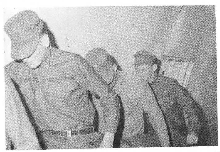
Grimacing, the Seabees move through the "gas chamber" after removing gas masks.