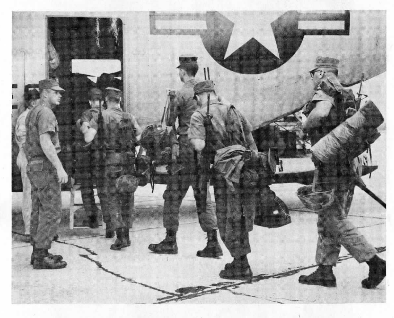
Members of MCB 128's advance party board plane.