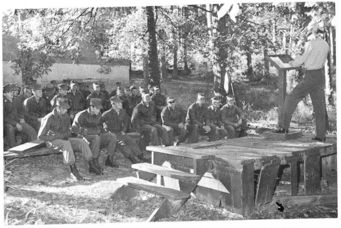
Classroom instruction, as well as work in the field, was an important part of Lejeune training.

Inclement weather forced the Seabees to abandon the three day field exercise before the scheduled completion date. The remaining days were utilized in 782 gear inspections, exercises at combat town, and other stages of military training.