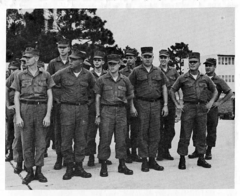
"H" Co. "Heroes" before trip to Camp LeJeune.

By 1830, everyone was on board, and the plane crew made the final check before lift off. Thus, the advance party from MCB 128 began its final phase of training before going in country.