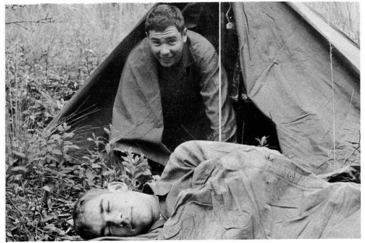
Seabees "roughed it" during the tactics training at Lejeune. A temporary defensive camp was established in the field with tents and "foxholes" serving as home.

Seabees of MCB-128 recently completed three weeks of advanced military training at Camp Lejeune, North Carolina. For many it was the second trip to the world's largest Marine Amphibious Training Base. Others, new to the "Bees" received their indoctrination into the continuous training cycle that Seabees undergo to assure absolute readiness for Vietnam deployments.