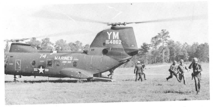
Helicopter mount-out exercises demonstrated speedy movement of a mobile unit.