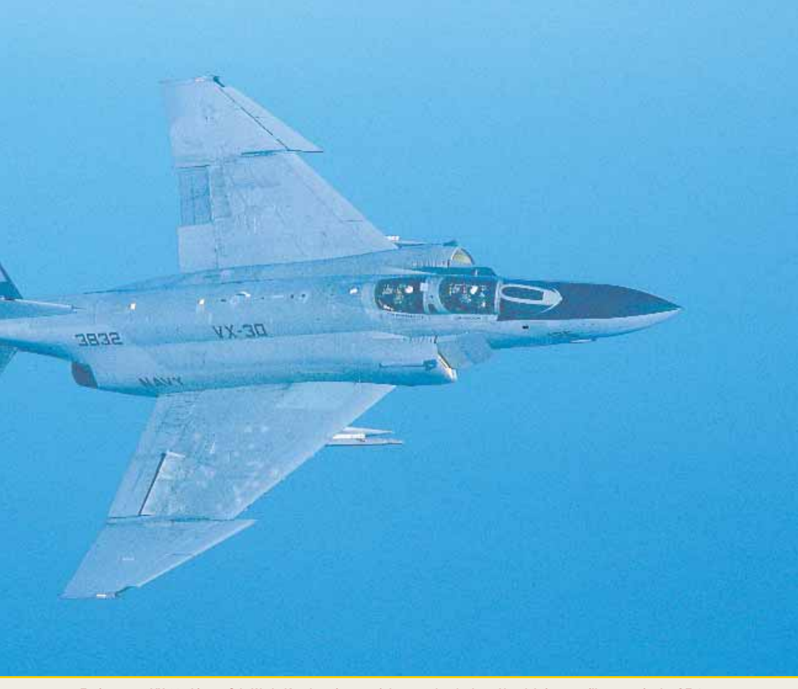
Facing page, VX-30 skipper Cdr. Wade Knudson is one of the squadron's three Naval Aviators still current in the QF-4. Above, a Bloodhounds QF-4S on a mission flown by Cdr. Knudson.

VX-30 assets routinely deploy worldwide to meet unique weapons testing needs at remote ranges and to provide fleet support.