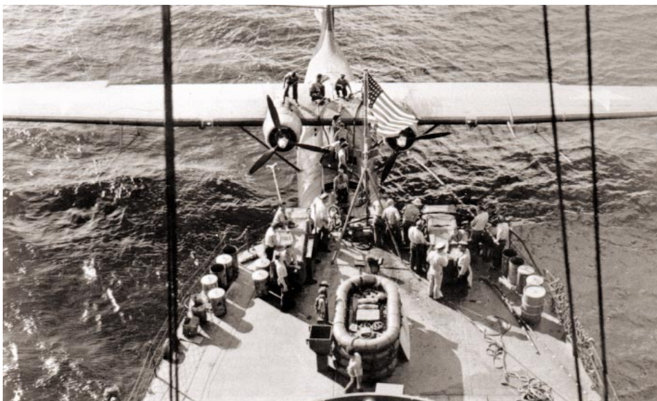
A squadron PBY-5 refueling from a tender, October 1942.