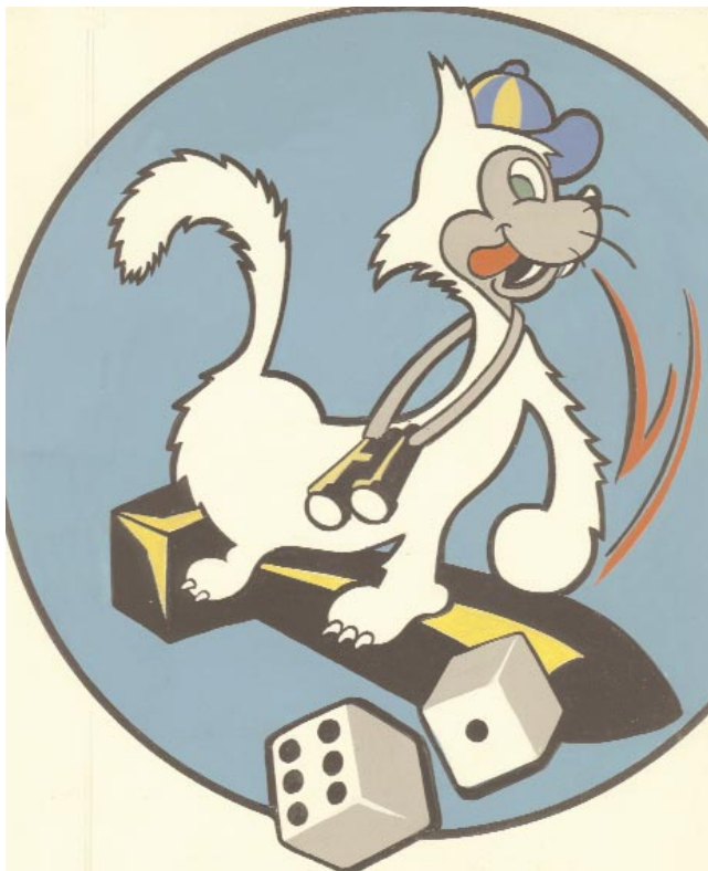
The squadron's cartoon cat insignia.

The only official insignia used by VPB-61 was submitted for approval on 28 June 1945, and was approved by CNO on 6 July 1945. The insignia was comprised of a cat, representing the PBV-5A Land Cats, rolling a lucky seven with a pair of dice. The cat was