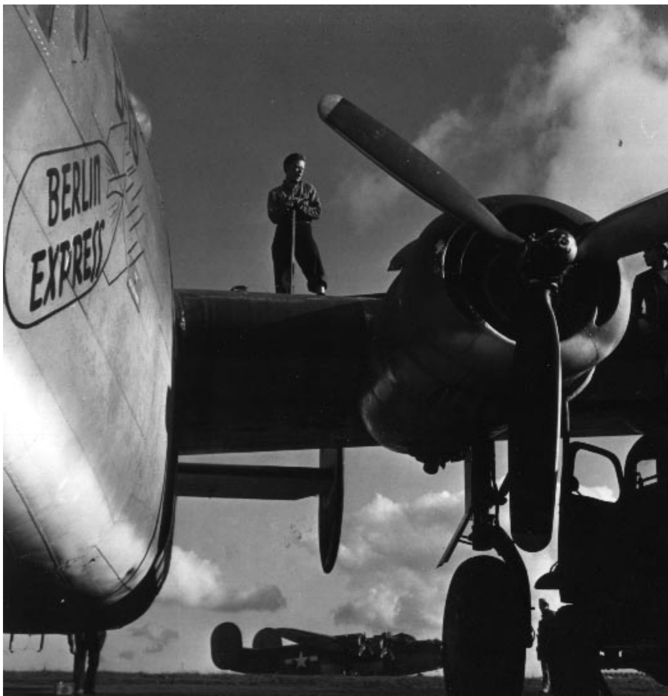
A PB4Y refueling in England prior to a Bay of Biscay patrol, November 1943, 80-G-407690.