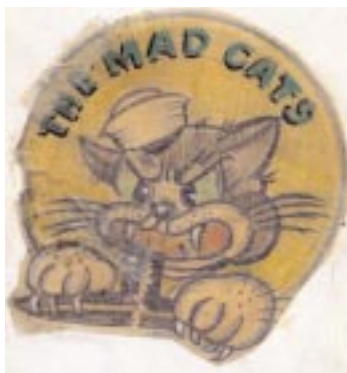
The squadron's insignia.

The squadron's only known insignia was approved by CNO on 3 November 1944, after it had been redesignated VPB-63. The design was inspired by the squadron's MAD gear. It featured the face of a "mad" cat wearing a sailor hat, holding a broken submarine in its paws.