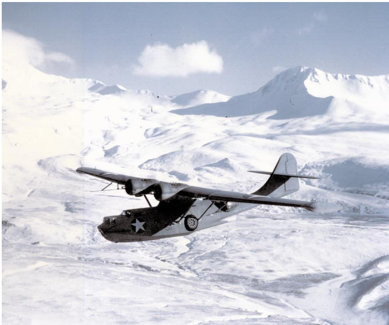
A PBY on patrol in the Aleutians area, March 1943, 80-G-K-8145.