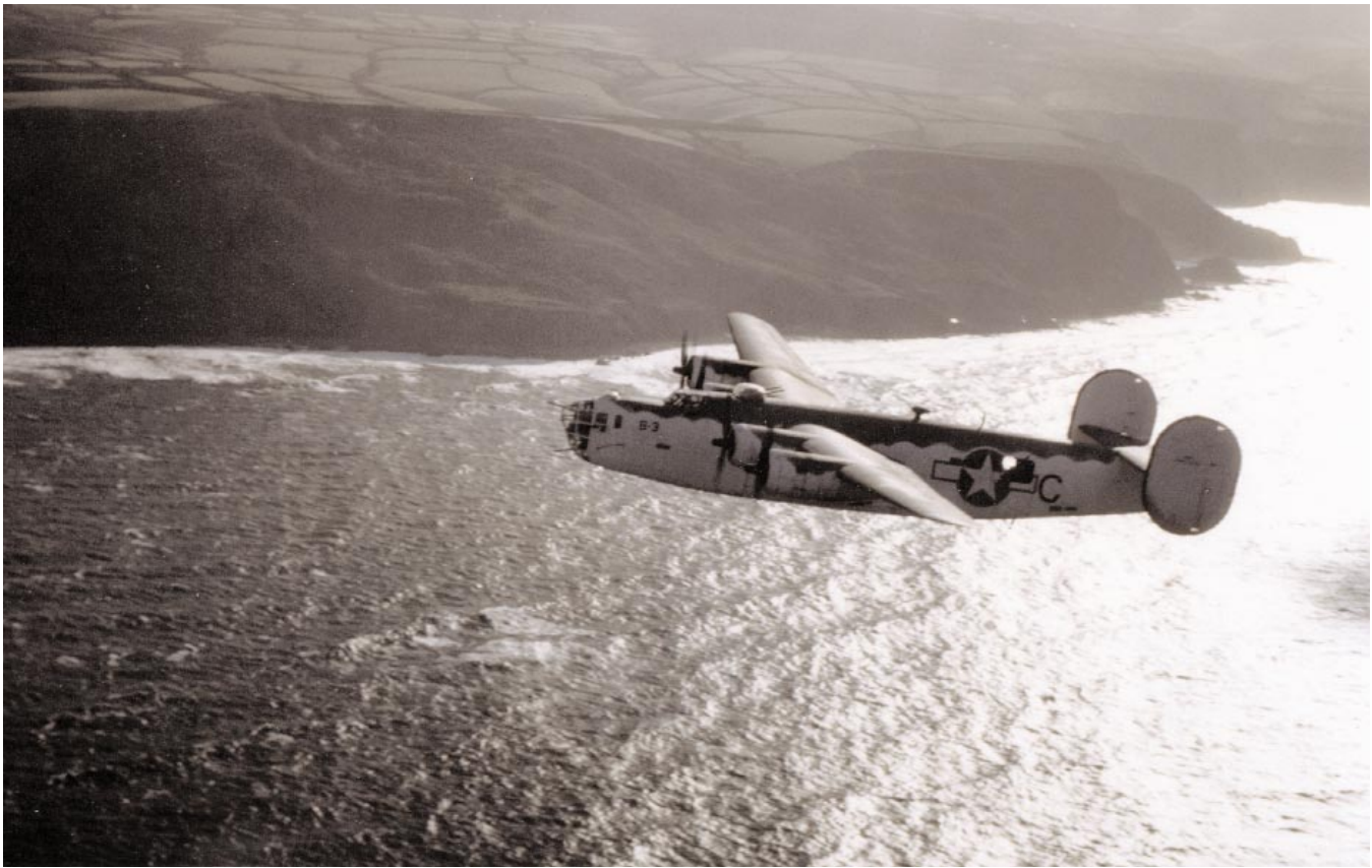
A PB4Y-1 en route to a mission over the Bay of Biscay, circa summer 1943, 80-G-K-14055.

Jul–Dec 1944: The capture of French ports used for submarine bases greatly curtailed the activities of the German U-boat fleet. The use of the schnorkel by the German U-boats made intercepts more dependent on the use of radar. Although 16 sonobuoys were dropped on radar contacts in the months of October to December 1944, the results were negative.