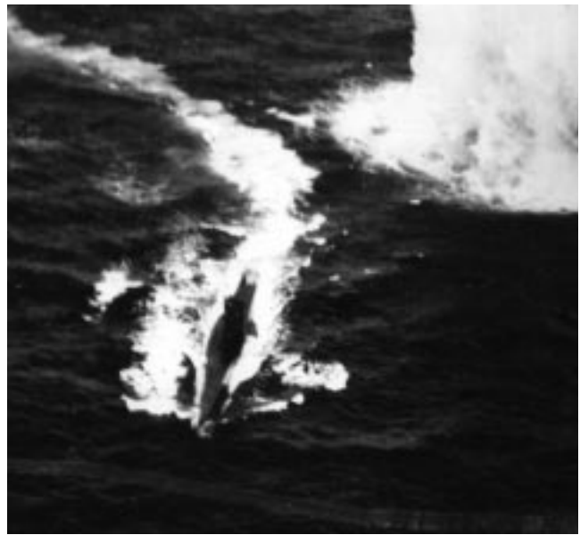
A squadron depth bomb explodes to port as U-467 turns hard right. U-467 was sunk by a squadron aircraft on 25 May 1943.