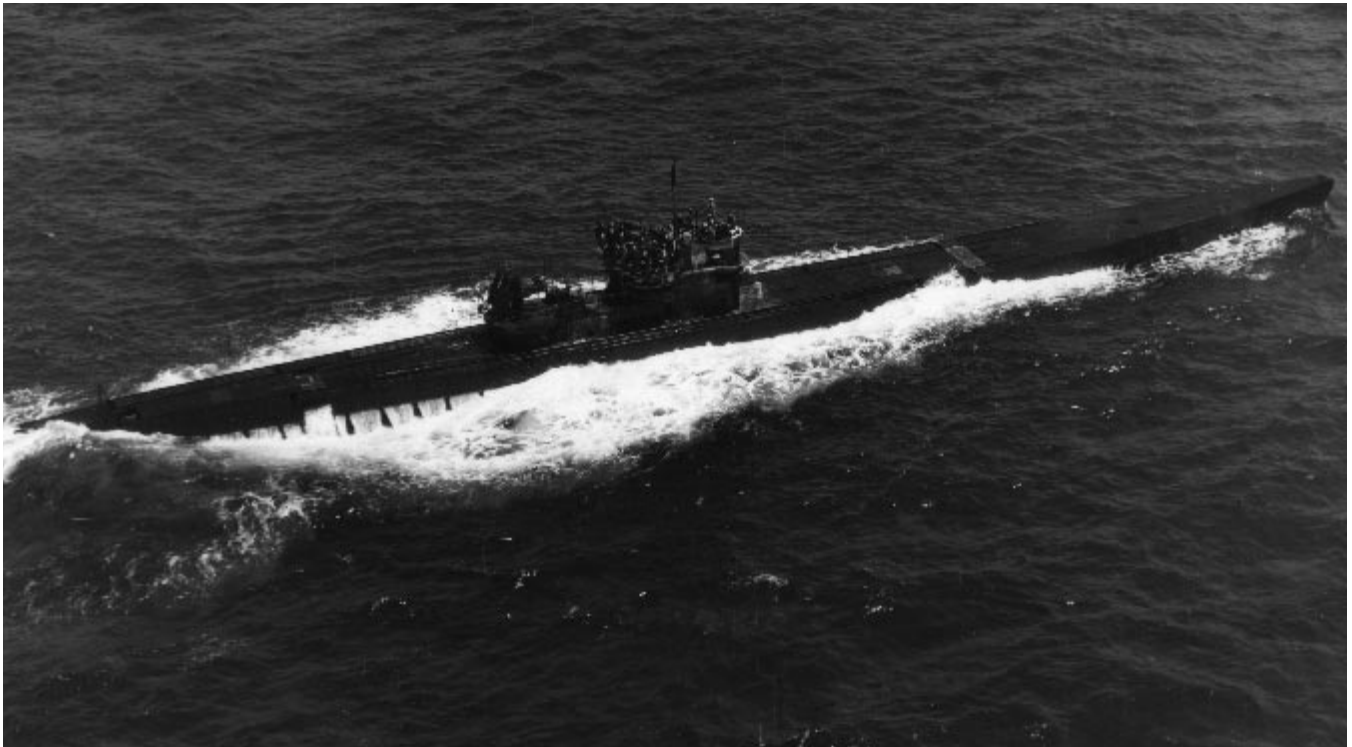
A close up of U-541 surrendering, 80-G-319659.