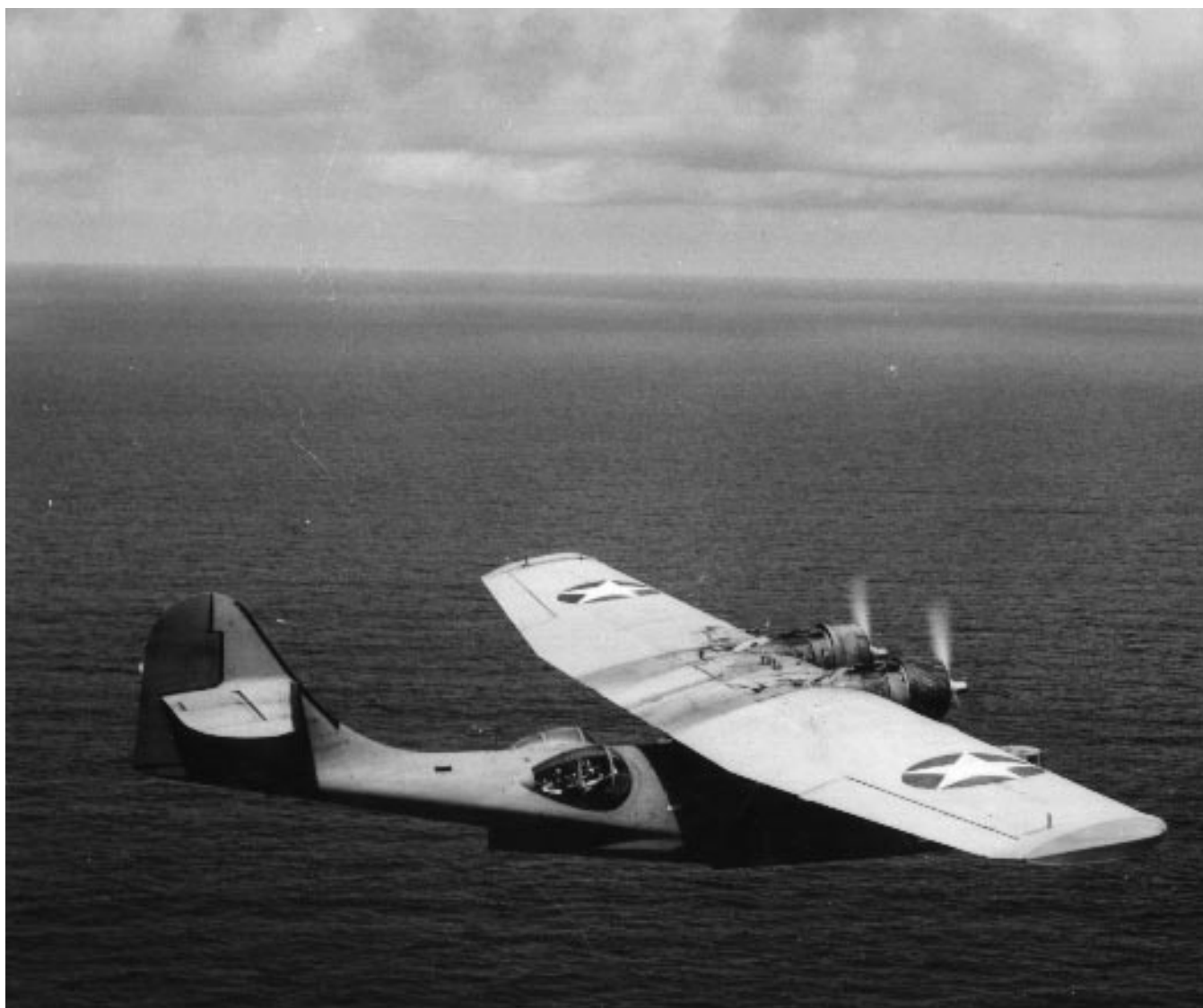
A squadron PBY-5A on patrol in the Caribbean, May 1942