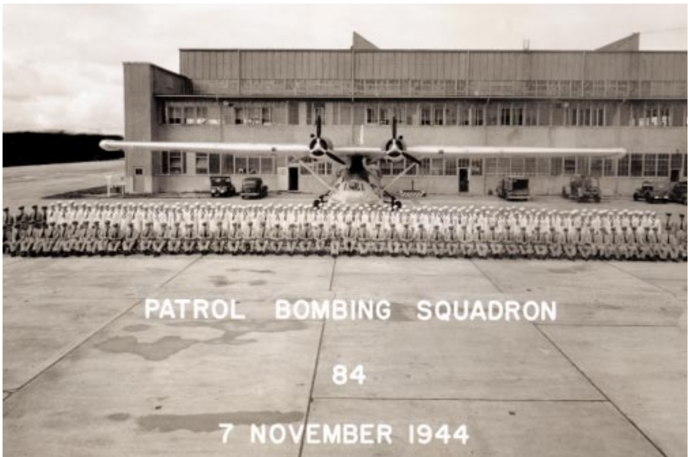
Squadron personnel with a squadron PBV-5A in the background, 7 November 1944.

28 Jun 1945: VPB-84 was disestablished at NAS Alameda, Calif. A large portion of the squadron pilots and crews were used for ferry duty on a temporary basis after disestablishment of the squadron.