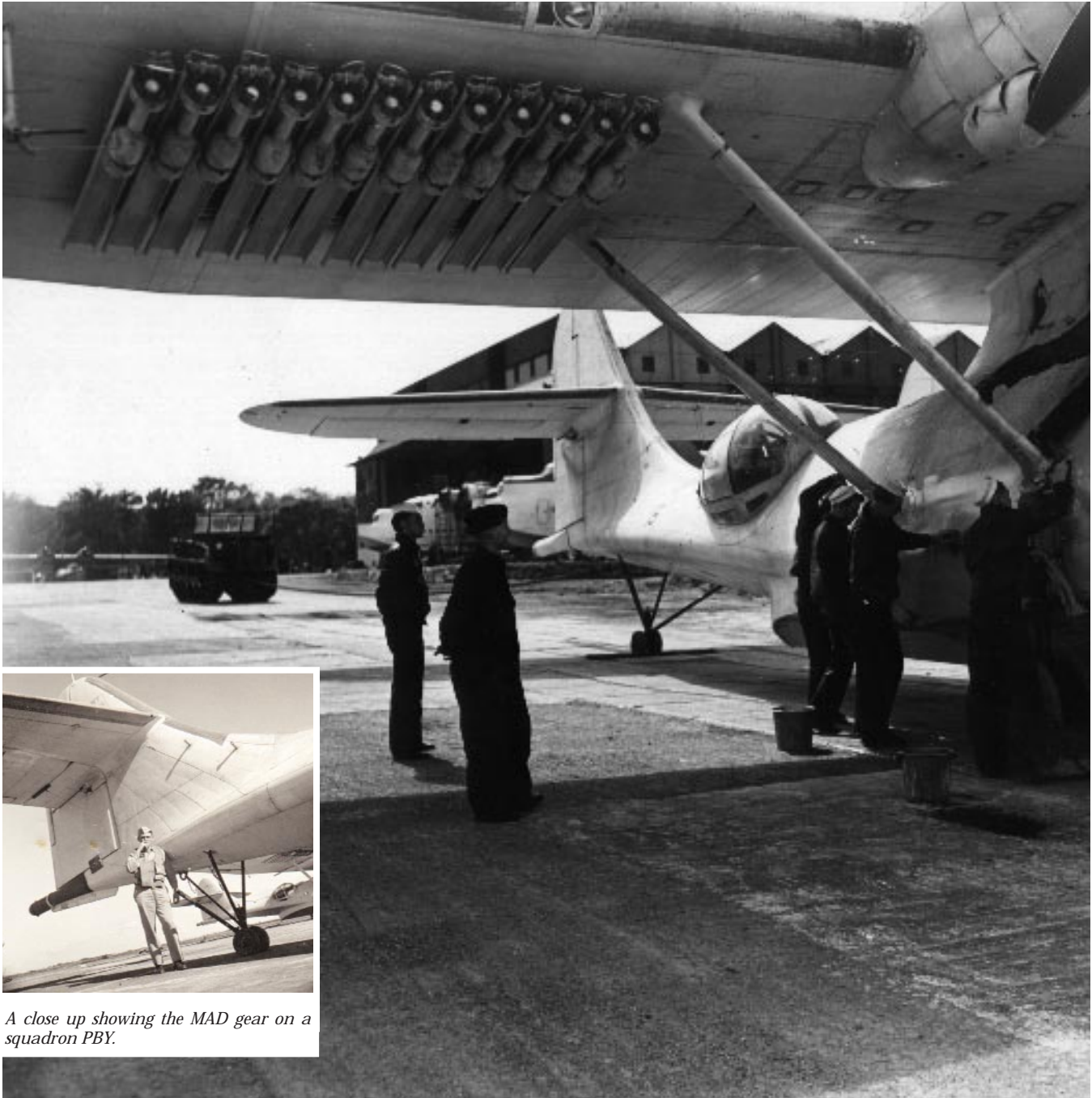
A close up showing the MAD gear on a squadron PBY.