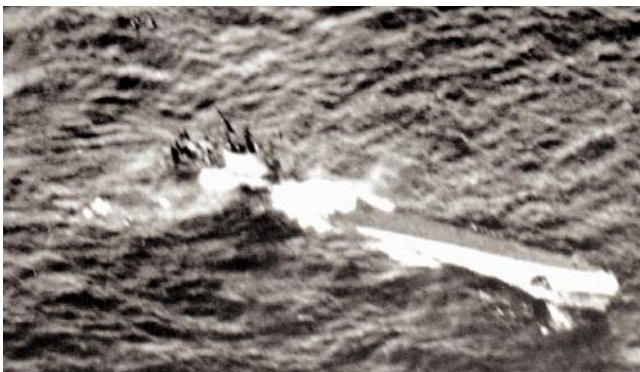
On 24 February 1944 U-761 was detected by squadron PBVs which tracked and assisted in the sinking of the submarine. This photo shows the crew of U-761 abandoning the submarine.