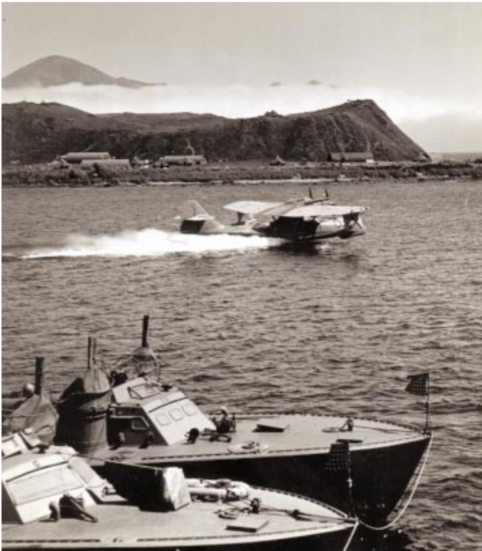
A PB4Y taxiing past two PT boats in the Aleutians, September 1943.

15 Sep 1944: VP-61 began flying inshore patrols along the shipping lanes, which extended the complete length of the Aleutian chain. To facilitate the coverage over these vast distances, the squadron was divided into detach-