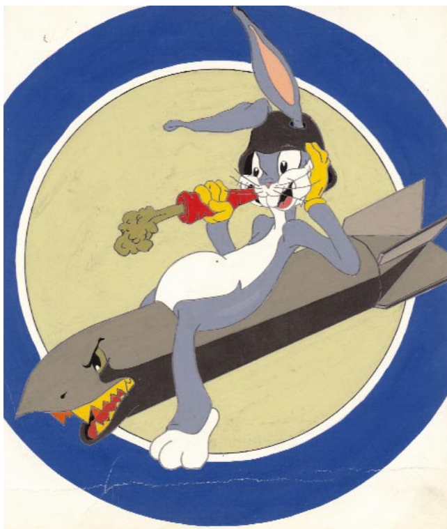
The squadron's only insignia.