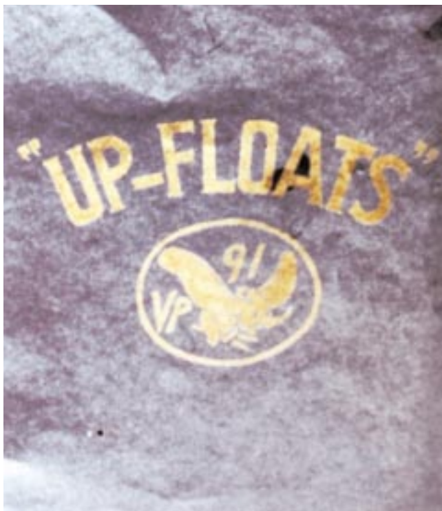
The squadron's insignia.

A photograph on file for VP-91 in the Aviation History Branch squadron insignia archives showed what appeared to be a Disney-like Dumbo elephant, with outstretched ears, astride two bombs. The figure