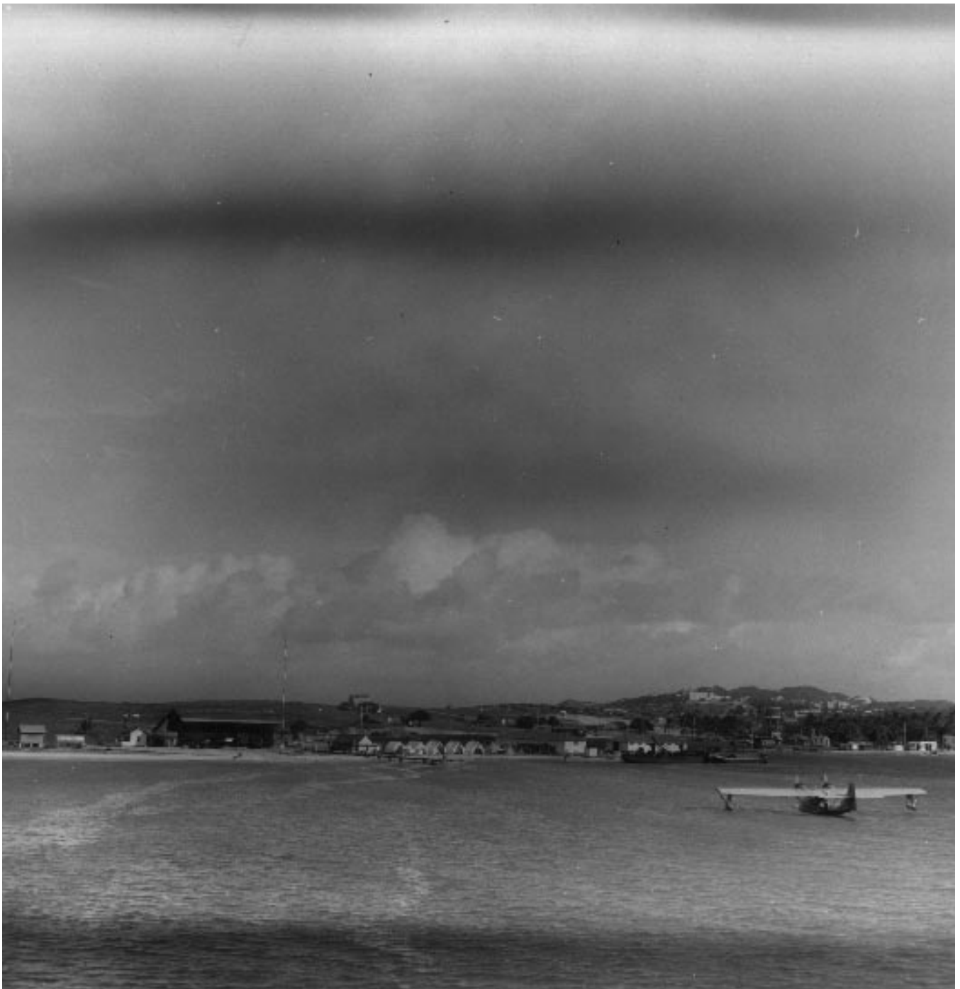
A squadron PB4Y at Natal, Brazil, 1942, 80-G-10663.