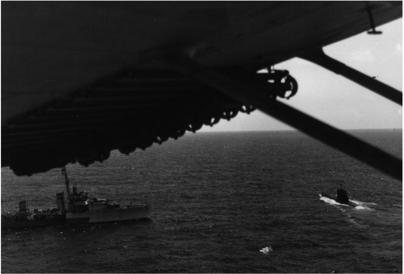
On 11 May 1945 U-541 surrendered to a squadron PBV. This photo shows the U-541 surfaced with a British destroyer on the far left, 80-G-319661.