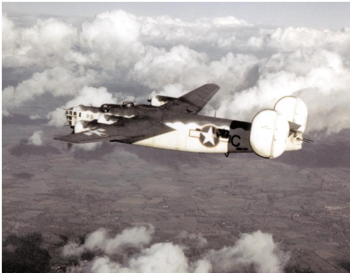
A PB4Y-1 flies over the English countryside en route to a patrol mission over the Bay of Biscay, circa summer 1943, 80-G-K-13688.

24 Sep–6 Nov 1943: The 19 th USAAF squadron departed Dunkeswell to join the 8 th Air Force, followed by the 22 nd USAAF on 28 September. Three Navy patrol squadrons (VBs 103, 110 and 105) took over the