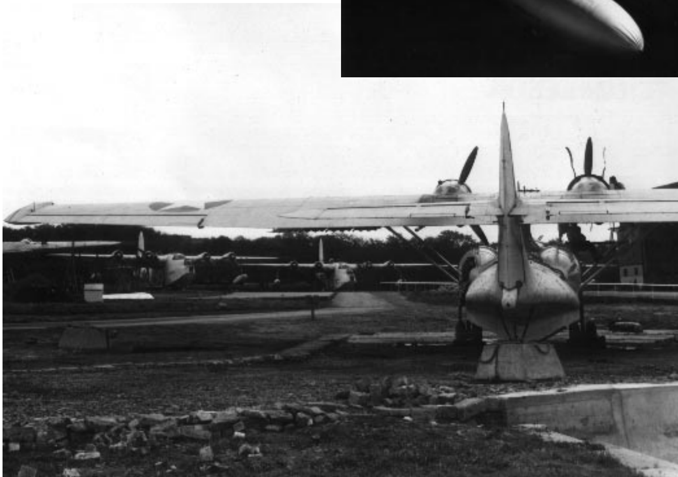
A squadron PBY-5A, 80-G-53247.