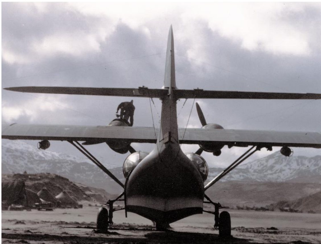
A PBY being serviced at an Aleutians airfield, July 1943, 80-G-K-8155.