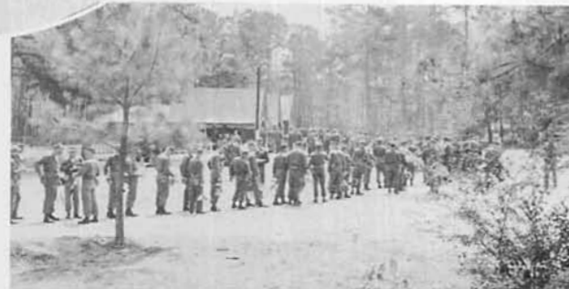
While at Lejeune, May 16, these men made rate.