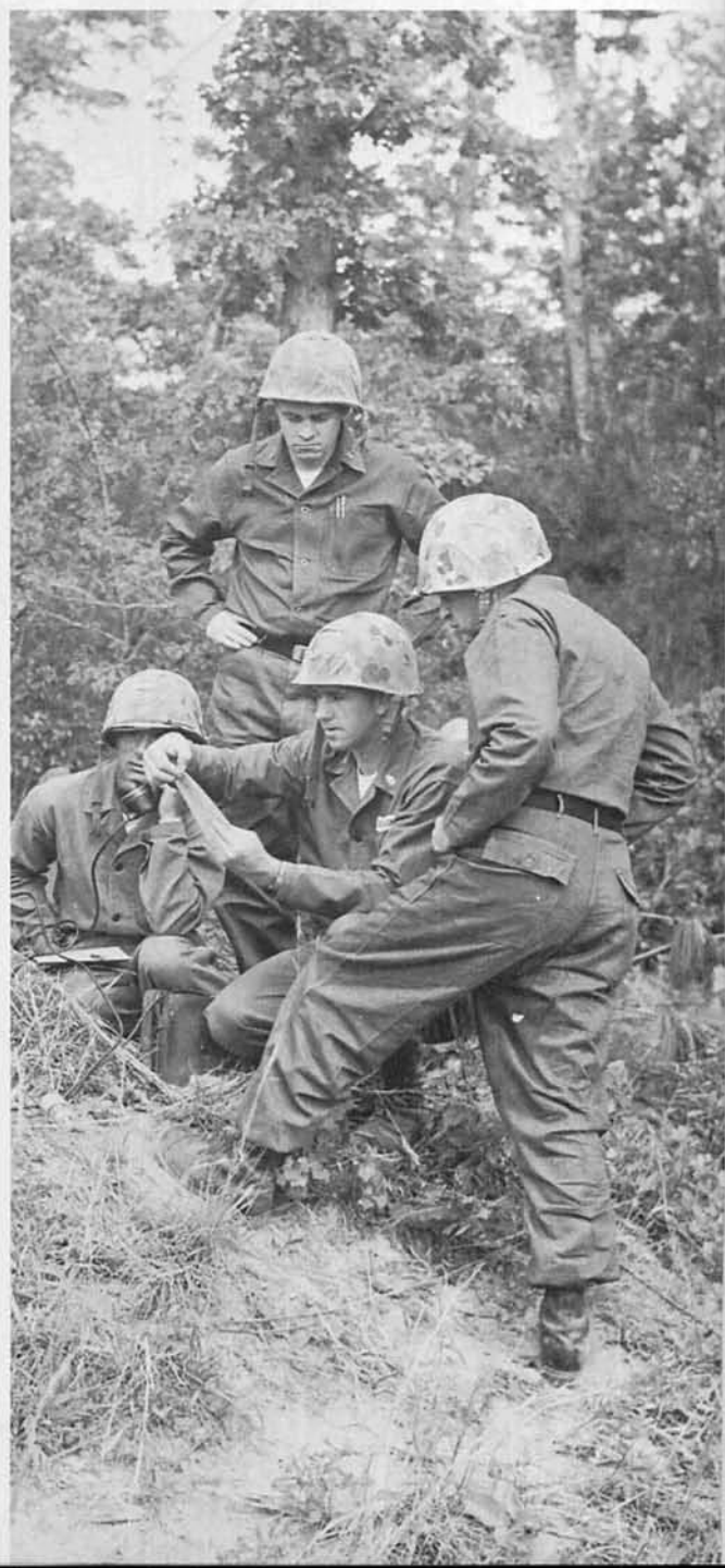
The basics of group defense are best taught in the field — under simulated combat situations.