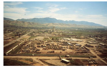
Aerial View of Camp D.W. Sommers with the Zakho 'Roo Zoo in foreground, OPC 1991.