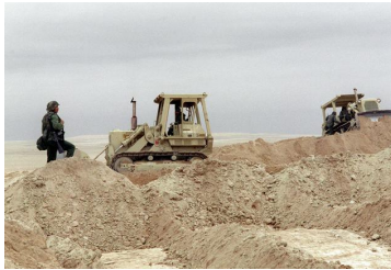
Equipment Operators at Work in the Desert, exact location unknown, 1990.