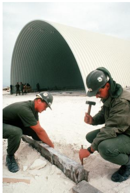
K-Span buildings are pre-engineered structures used predominantly for open storage. Exact location unknown, 1990.