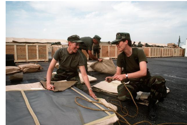
Seabees setting up camp in the Desert, exact location unknown, 1990.