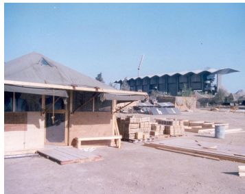
Seabee Camp in the Desert, exact location unknown, 1990.