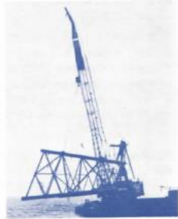
▲ Swinging the jacket around the stern of the derrick barge.