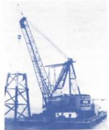
Lowering the jacket in place. ►