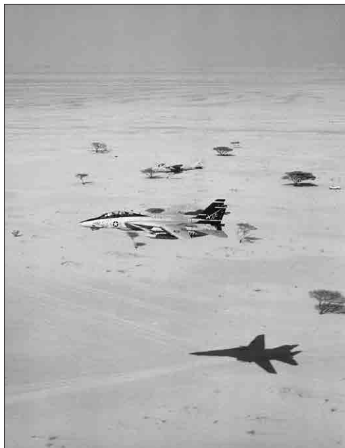
A VF-32 F-14A Tomcat and an A-6E Intruder assigned to CVW-3, deployed with John F. Kennedy (CV 67) in support of Operation Desert Shield, cruise at low level over the Saudi desert, 25 October 1990.

17 JANUARY • At 0215, the Iraqis began to fire an estimated eight Scud-B (R-17E) surface-to-surface missiles at Haifa and Tel Aviv, Israel. Saddam Hussein's ploy threatened to drag the Israelis into the war, which would have enraged Arabs and unraveled the coalition. The Pentagon announced that allied forces had destroyed stationary Scud sites in Iraq, but pilots started to seek out elusive mobile sites in what they termed