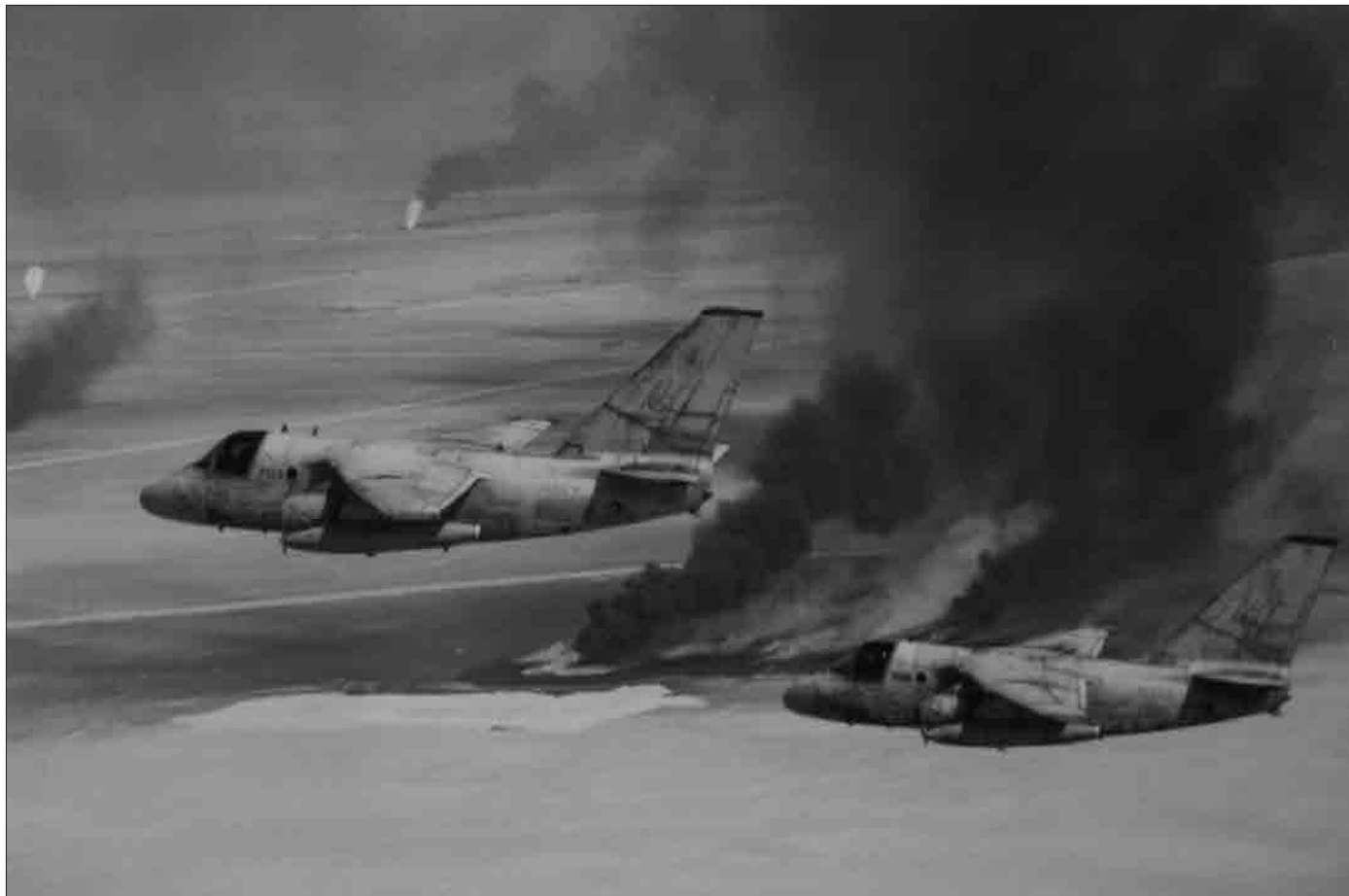
S-3B Vikings of VS-29 from Abraham Lincoln (CVN 72) fly over burning Kuwaiti oil fields, c. 1991.