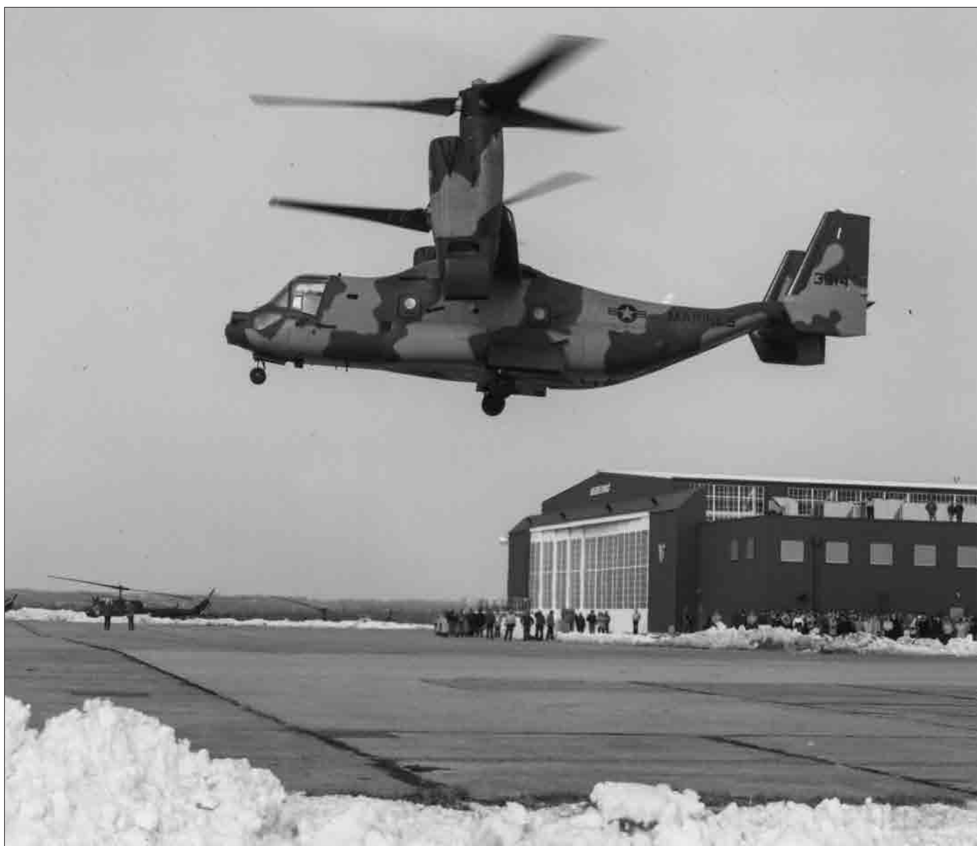
This V-22 Osprey test aircraft, BuNo 163914, was the fourth built. It crashed during a demonstration flight near MCAS Quantico, Va., 20 July 1992, killing seven.

22 MAY • VQ-5 took delivery of its first ES-3A at NAS Agana, Guam, marking the operational service entry of the electronic reconnaissance version of the Vikings.