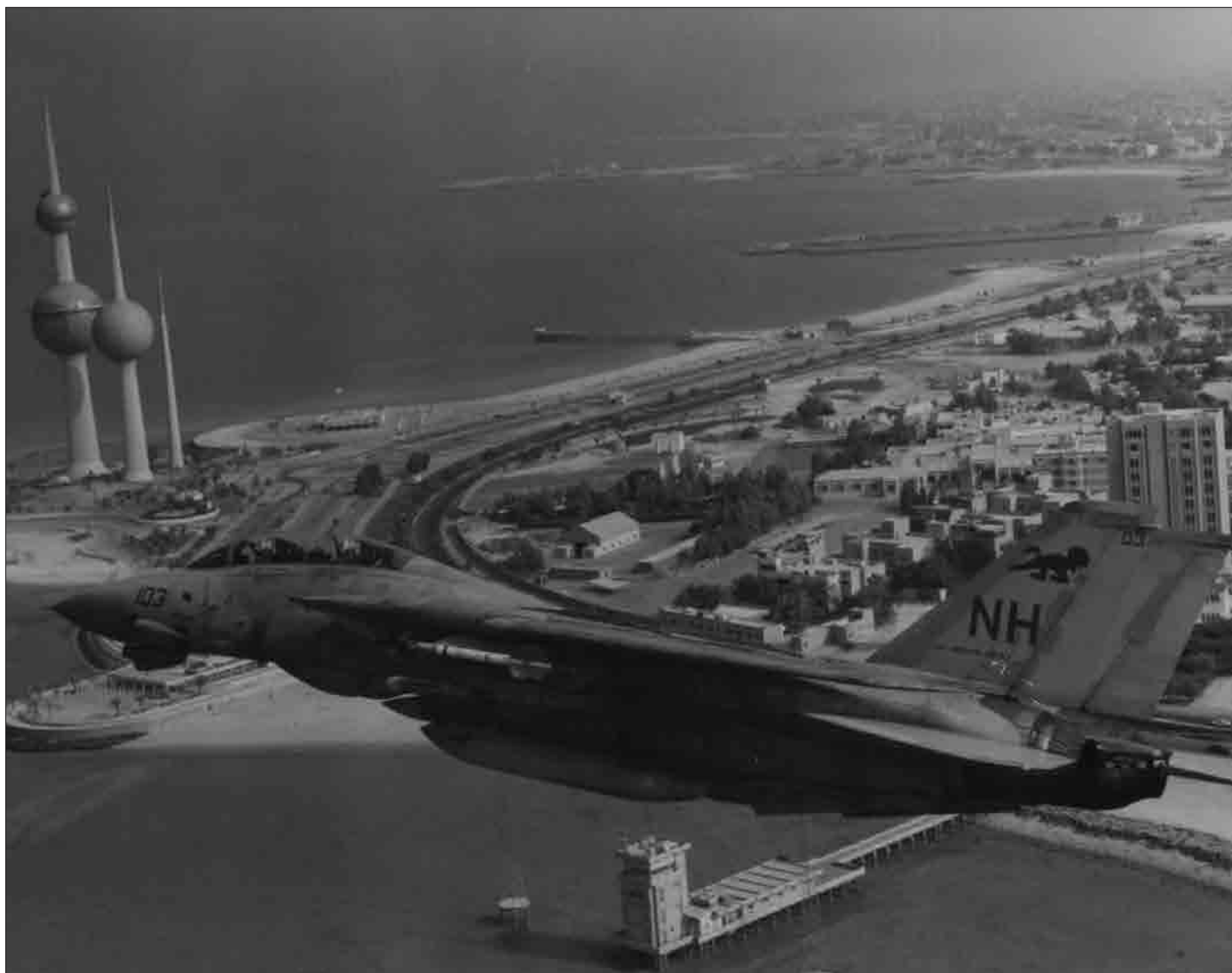
An F-14A Tomcat of VF-114 off Abraham Lincoln (CVN 72) patrols over Kuwait City with Kuwait Towers as a prominent landmark, c. 1991.

dismounted and fled there on foot. Air strikes killed several hundred of them and destroyed an estimated 1,400 tanks, armored vehicles, jeeps, cars, buses, and tractor-trailers.