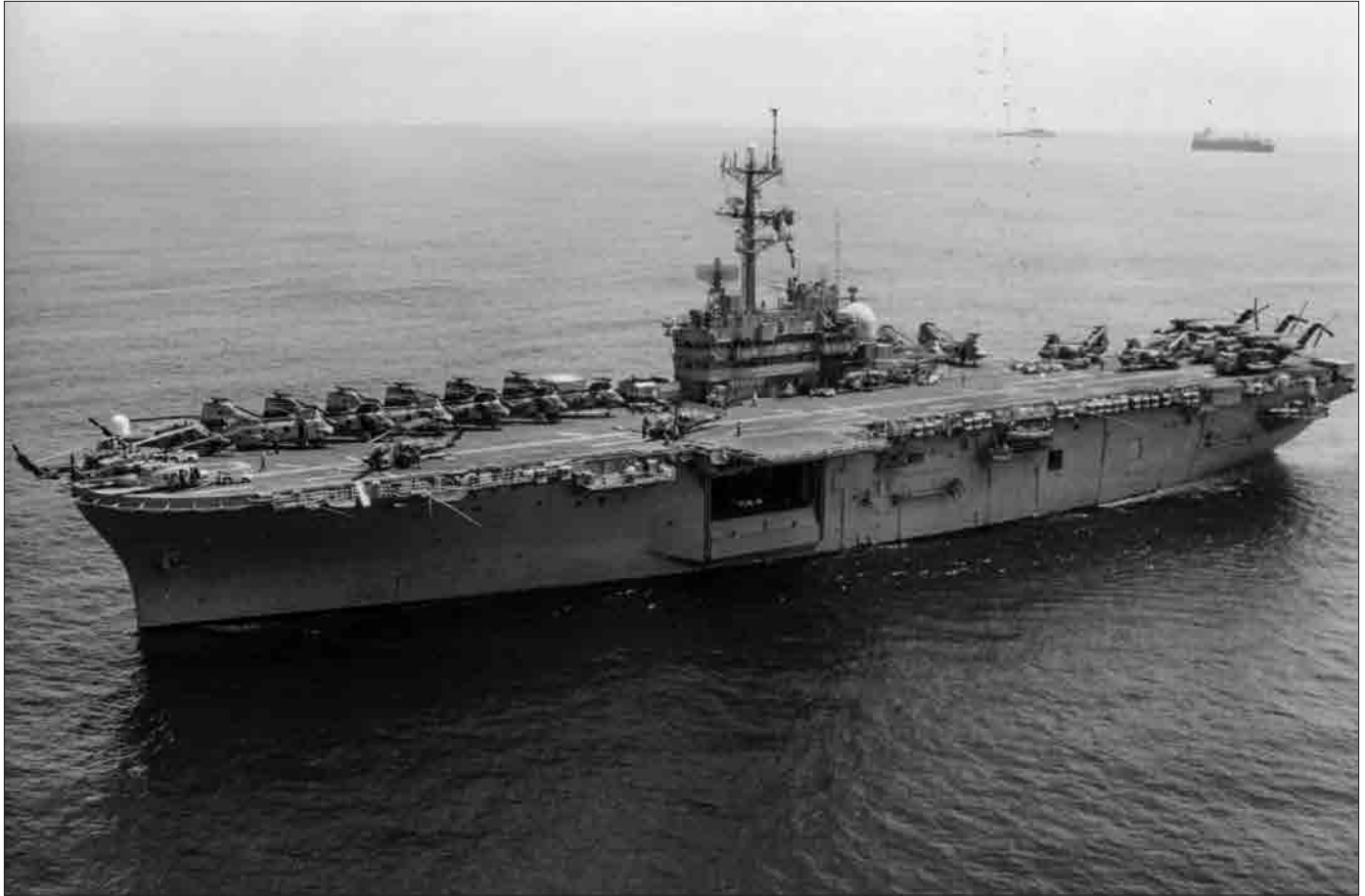
Amphibious assault ship Tripoli (LPH 10) provides humanitarian relief to refugees at Mogadishu, Somalia, during her deployment to support Operation Restore Hope, 3 December 1992–2 February 1993.

developed in response to the shift from global to regional threats against U.S. national security. The plan emphasized littoral warfare and maneuver from the sea.