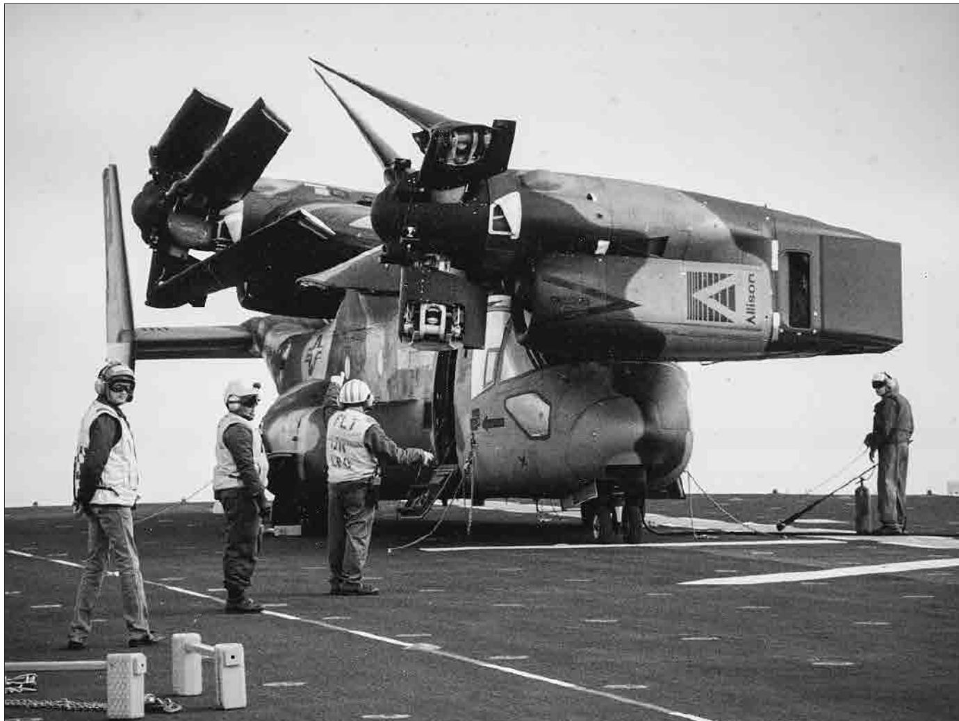
With rotated wing, engine pods, and folding rotor blades, the MV-22A Osprey makes a compact package for shipboard storage.

the Marine Corps grounded the remaining three prototype Ospreys pending the results of the mishap investigation. Investigators blamed the accident on mechanical failure caused by a flash fire, engine failure, and a failed drive shaft.