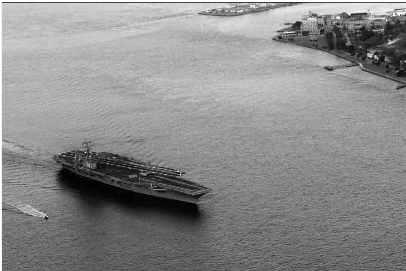
Before commissioning, John C. Stennis (CVN 74) leaves the James River and heads to sea for builders trials off the Virginia Capes, 23 October 1995.

24 JANUARY • NAWC (WD) Point Mugu, Calif., conducted flight performance testing of the ADM-141C Improved TALD (tactical air launch decoy), which was designed to deceive enemy radar and interception aircraft in hostile environments.