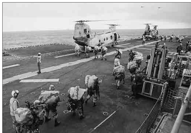
Marines embark CH-46E Sea Knights of HMM-164 on board amphibious assault ship Tripoli (LPH 10) during the early stages of Operation Restore Hope, 3 December 1992–2 February 1993.

16 DECEMBER • Kitty Hawk (CV 63) deployed five air traffic controllers to cruiser Leahy (CG 53) to establish approach control services in support of Operation Restore Hope at Mogadishu, Somalia. An E-2C Hawkeye of VAW-114 picked up approaching aircraft, tracked their flights, and issued advisories from 200 miles out. When the flights reached to within a range of 50 miles, Leahy took over and led them to within visual range of the airport ten miles away.