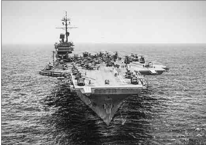
Army and Navy helicopters pack the flight deck of Dwight D. Eisenhower (CVN 69) as she steams to Haitian waters, September 1994. During Operation Uphold Democracy she transported about 1,800 soldiers of the Army's XVIII Airborne Corps.

emphasized that the naval forces of the future would deploy smaller numbers of ships, aircraft, and personnel but operate at enhanced capability because of new technologies and prudent cost-cutting measures.