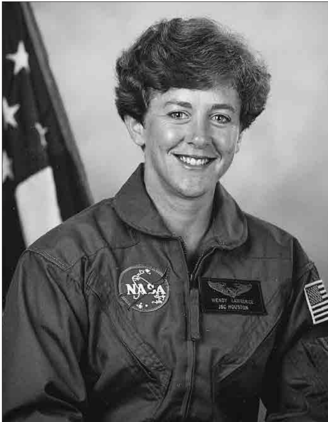
Lt. Cmdr. Wendy B. Lawrence is the first female U.S. Naval Academy graduate astronaut, and on 2 March 1995 became the first female naval aviator in space.

10 APRIL • VA-196 accepted the last rewinged A-6E, BuNo 159579, at NAS Whidbey Island, Wash. From June 1989, NAD Alameda, Calif., had rewinged 23 Intruders.