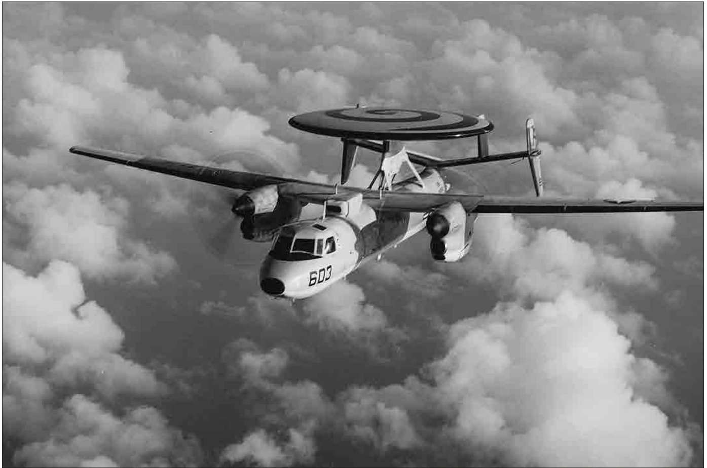
E-2C Hawkeyes are the eyes of the fleet. The airborne early warning and command and control aircraft were first deployed in 1964.

29 MARCH • The Tier III Minus DarkStar high-altitude long-endurance unmanned aerial vehicle successfully completed its first flight at the USAF Test Flight Center, Edwards AFB, Calif.