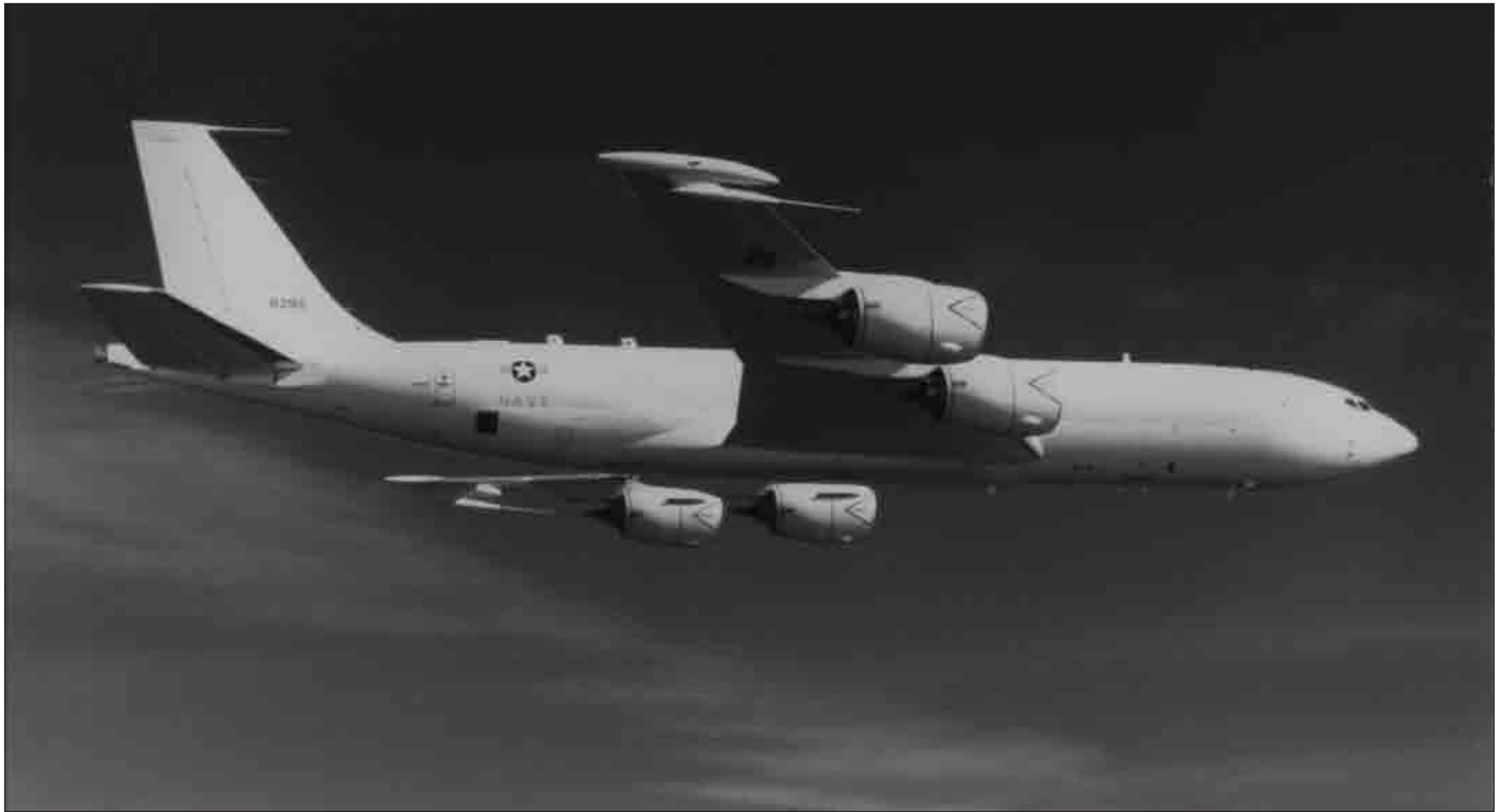
This E-6A Mercury, BuNo 163918, is one of 16 of the strategic communications relay aircraft type. The Navy subsequently upgraded all of these jets to E-6B standard.

1 APRIL • The Chief of Naval Operations directed the retirement of the remaining A-7 Corsair IIs in active inventory by 1 April. The service subsequently partially reversed the decision in order to retain 11 TA-7Cs and three EA-7Ls with NAWC as chase aircraft for various activities, including the BGM-109 Tomahawk missile program.