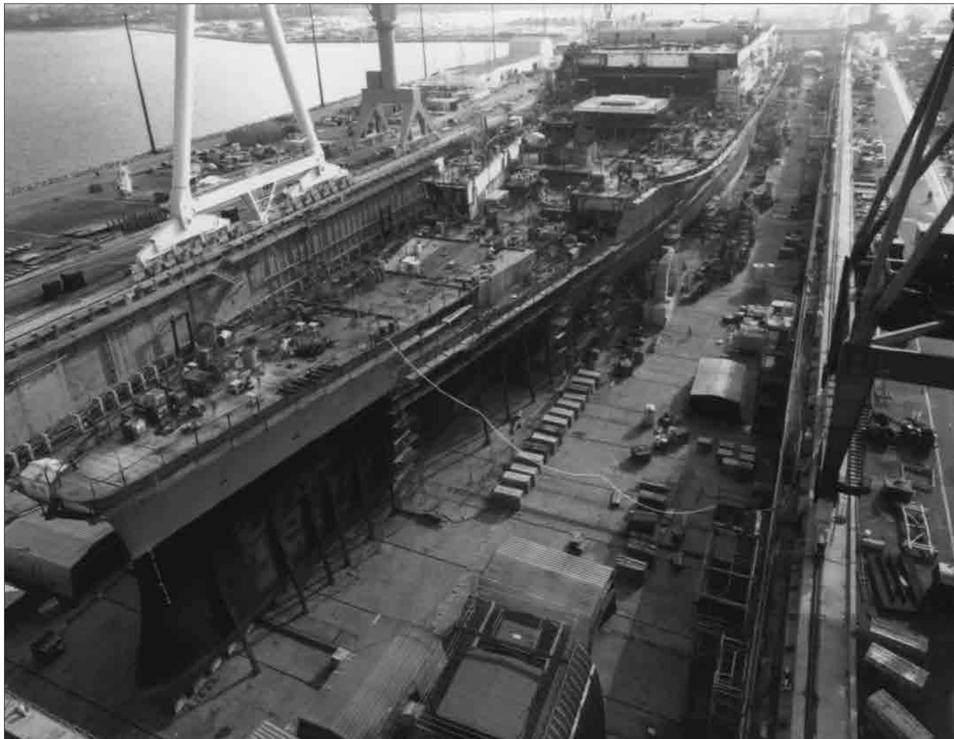
Harry S. Truman (CVN 75), laid down on 29 November 1993, is under construction at Newport News, Va. She was commissioned on 25 July 1998.

Marines and SEALs clashed with Somali clansmen during the withdrawal. Amphibious assault ship Essex (LHD 2) also took part in the evacuations, which concluded on 2 March.