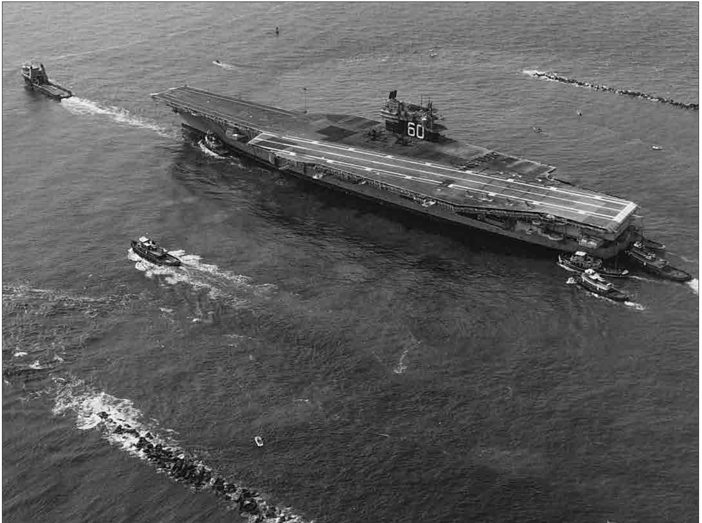
Former Saratoga (CV 60) under tow to Philadelphia, Pa., from Naval Station Mayport, Fla., where she was decommissioned on 20 August 1994.

provisional president. The UN authorized force to restore order and the United States initiated Operations Support Democracy and Uphold/Restore Democracy—Uphold Democracy for a peaceful entry into Haiti, and Restore Democracy in the event of resistance.