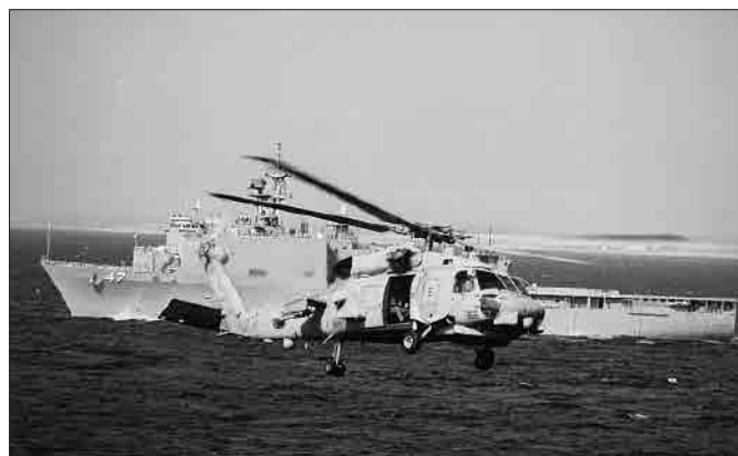
An SH-60B Seahawk flies past dock landing ship Rushmore (LSD 47) en route to amphibious assault ship Tripoli (LPH 10), during operations off Somalia in late 1992 or early 1993.

19 DECEMBER • Kitty Hawk (CV 63) relieved Ranger (CV 61) off Somalia in support of Operation Restore Hope.