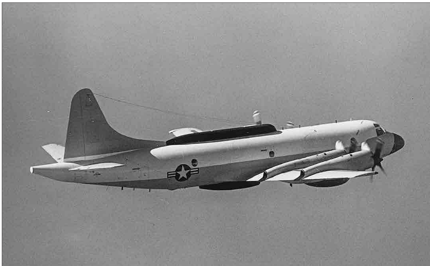
This EP-3E Aries II, BuNo 149668, is a modified P-3A Orion, which was delivered on 31 July 1962. It was converted in 1970 and transferred to VQ-2 on 30 July 1971 and provided intelligence, surveillance, and reconnaissance until retired in 1995.

20 AUGUST • Operation Infinite Reach (Resolute Response) began—two simultaneous retaliatory raids in response to the twin al-Qaeda attacks on the embassies in East Africa on 7 August. Cruisers Cowpens (CG 63) and Shiloh (CG 67), destroyers Elliot (DD 967) and Milius (DDG 69), and submarine Columbia (SSN 771) of the Abraham Lincoln (CVN 72) Carrier Battle Group sailing in the north Arabian Sea fired 73 BGM-109 TLAMs (Tomahawk Land Attack Missiles) at the Zhawar Kili al-Badr terrorist training and support complex, 30 miles southwest of Khowst, Afghanistan. Destroyers Briscoe (DD 977) and Hayler (DD 997) steaming in the Red Sea launched six TLAMs against the al-Shifa pharmaceutical plant near Khartoum, Sudan. Intelligence analysts suspected the plant of having ties to terrorist leader Osama bin Laden and of manufacturing precursor chemicals for the deadly VX series of nerve gas. The Sudanese and critics claimed that the plant did not produce VX. Vessels involved in these battles included amphibious assault ship Essex (LHD 2), dock landing ship Anchorage (LSD 36),