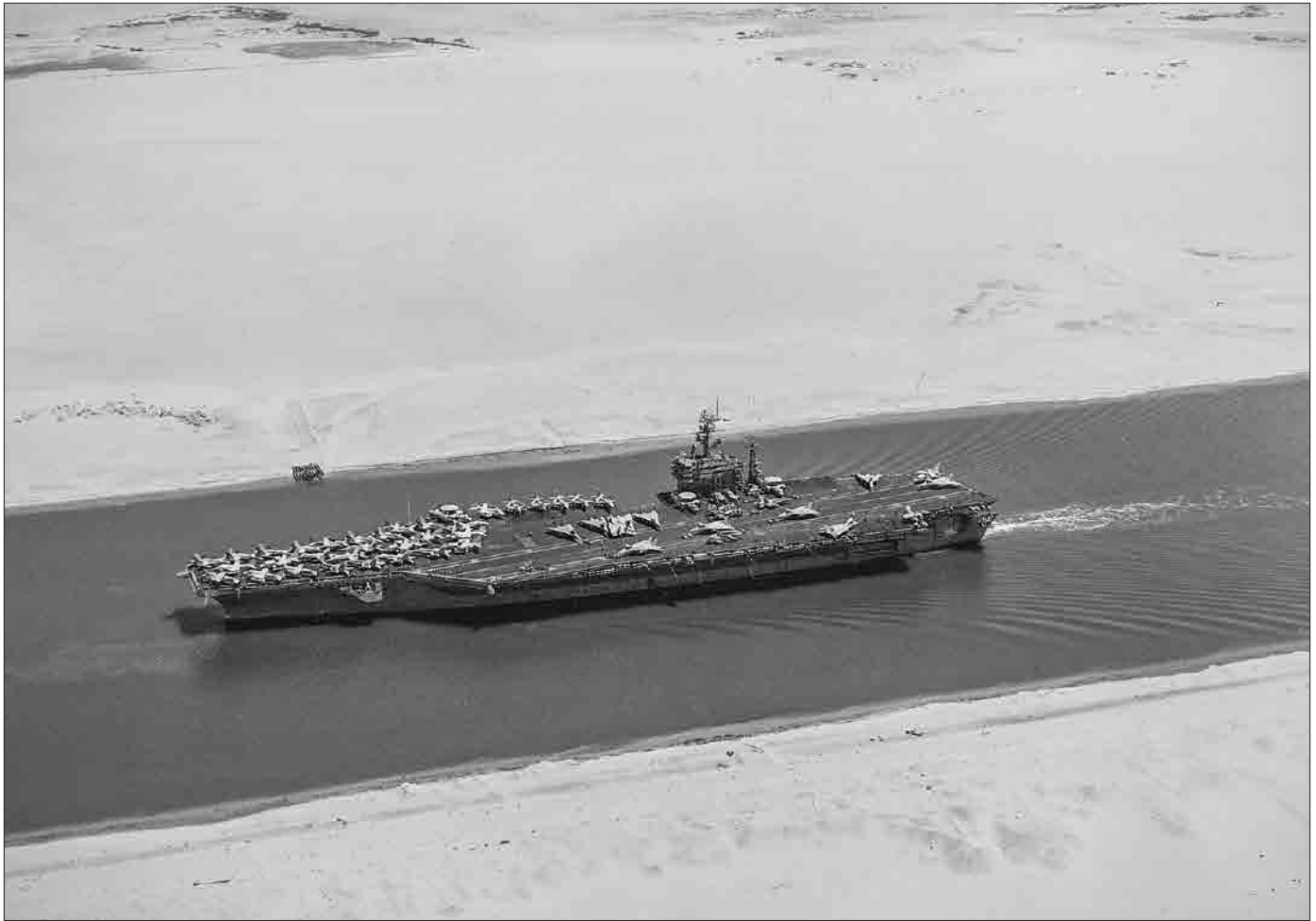
Dwight D. Eisenhower (CVN 69) with Carrier Air Wing 7 embarked, the first carrier to conduct sustained operations in the Red Sea in response to Iraq's invasion of Kuwait, passes through the Suez Canal on 8 August 1990.

The changes in the global balance had also enabled Muslim extremists to rise to power. In the early 1980s, Saudi émigré terrorist Osama bin Laden and others had developed al-Qaeda (The Base, or the International Front for Fighting Jews and Crusaders) to support the war in Afghanistan against the Soviets. They subsequently refocused their hatred against the United States and its allies after the expulsion of the Marxist regime from that country. One of their primary goals was to drive U.S. armed forces, which they perceived as representing America's "infidel" policies (and which the terrorists deemed inconsistent with al-Qaeda's Islamic extremism) from Saudi Arabia and its neighboring countries.