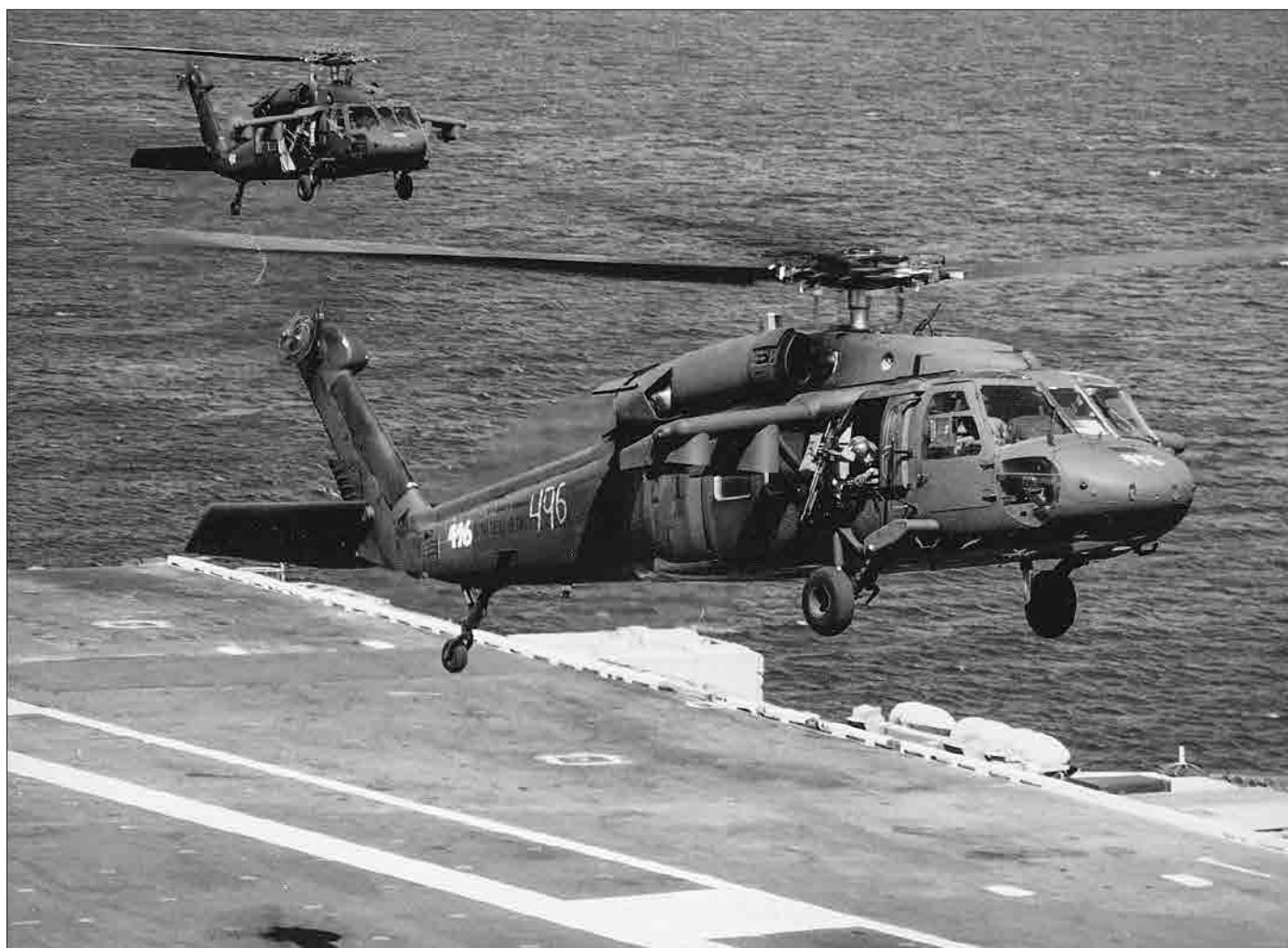
Army UH-60 Black Hawks lift off from the flight deck of Dwight D. Eisenhower (CVN 69) off the coast of Haiti during Operation Uphold Democracy, September 1994.

16 MAY • Seventeen Russian pilots tested nine two-seat F/A-18s at NAS Patuxent River, Md., accompanied by U.S. Navy pilots in the back seats.