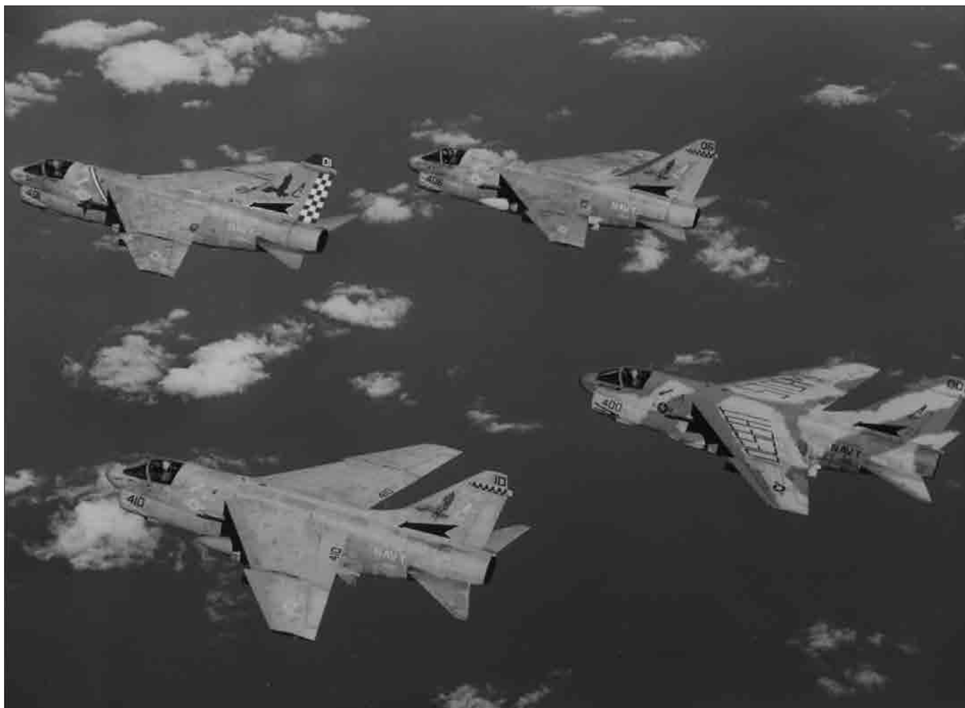
A-7E Corsair IIs of VA-72 return home from John F. Kennedy (CV 67) after their service during Operation Desert Storm. The return of VA-46 along with VA-72 marks the final operational deployment of Corsair IIs.

against Saddam Hussein, but the Iraqis recaptured the main towns and cities of Kurdistan. The Turk refusal to allow refugees entry left many Kurds stranded in the mountains during bitterly cold weather. The coalition initiated Operation Provide Comfort to aid the refugees.