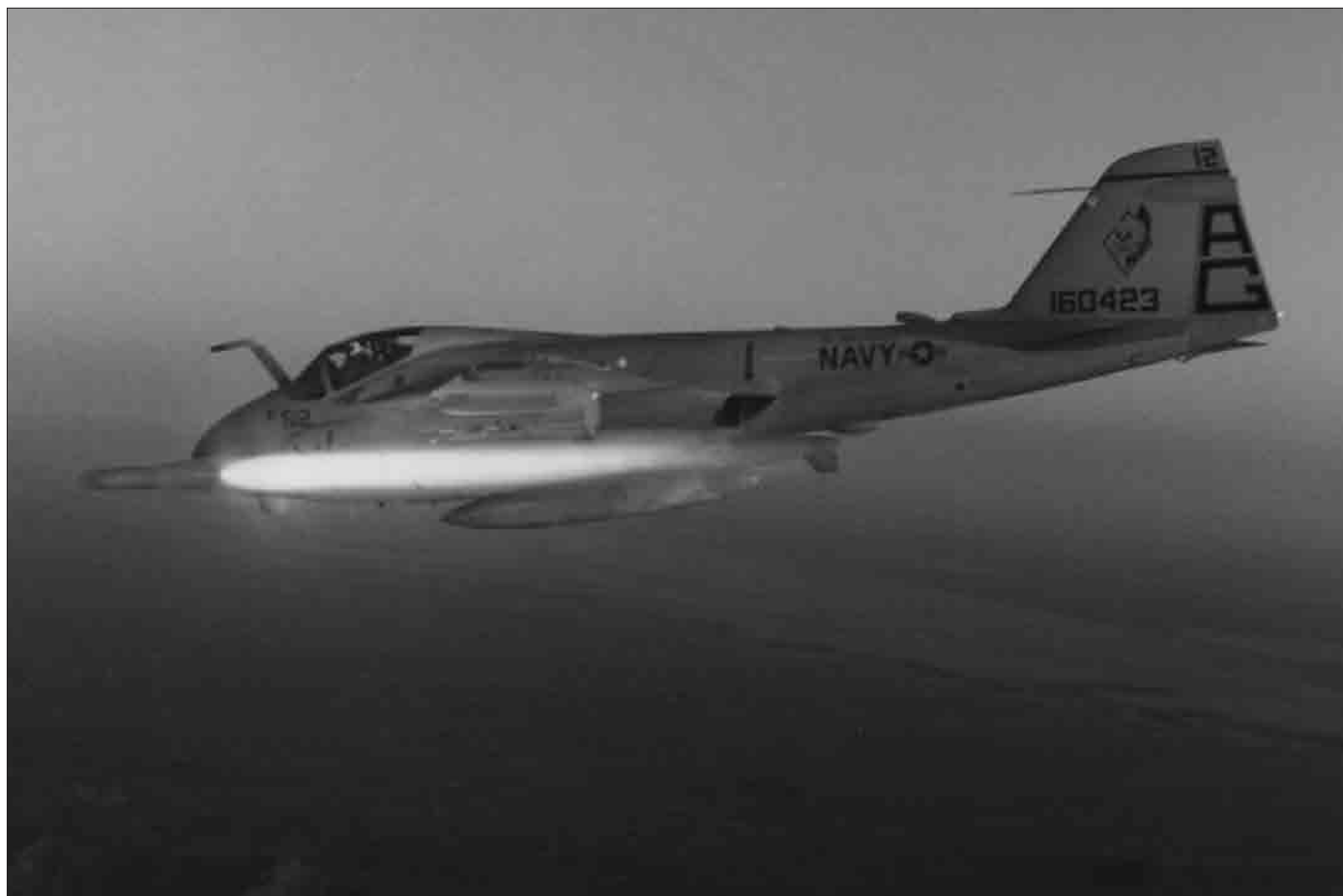
An A-6E Intruder, BuNo 160423, from VA-34 assigned to CVW-7 launches an AGM-65 Maverick air-to-ground missile near Naval Air Station Fallon, Nev., in late 1993.

National Museum of Naval Aviation 1996.253.6851