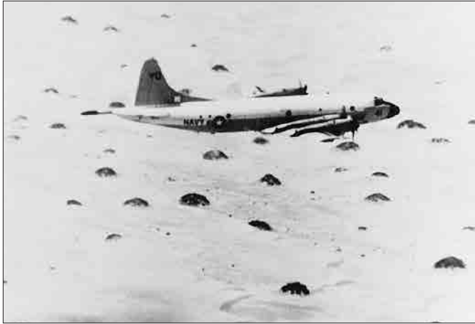
A P-3C Orion of VP-4 patrols over the Arabian Desert during Operation Desert Storm.