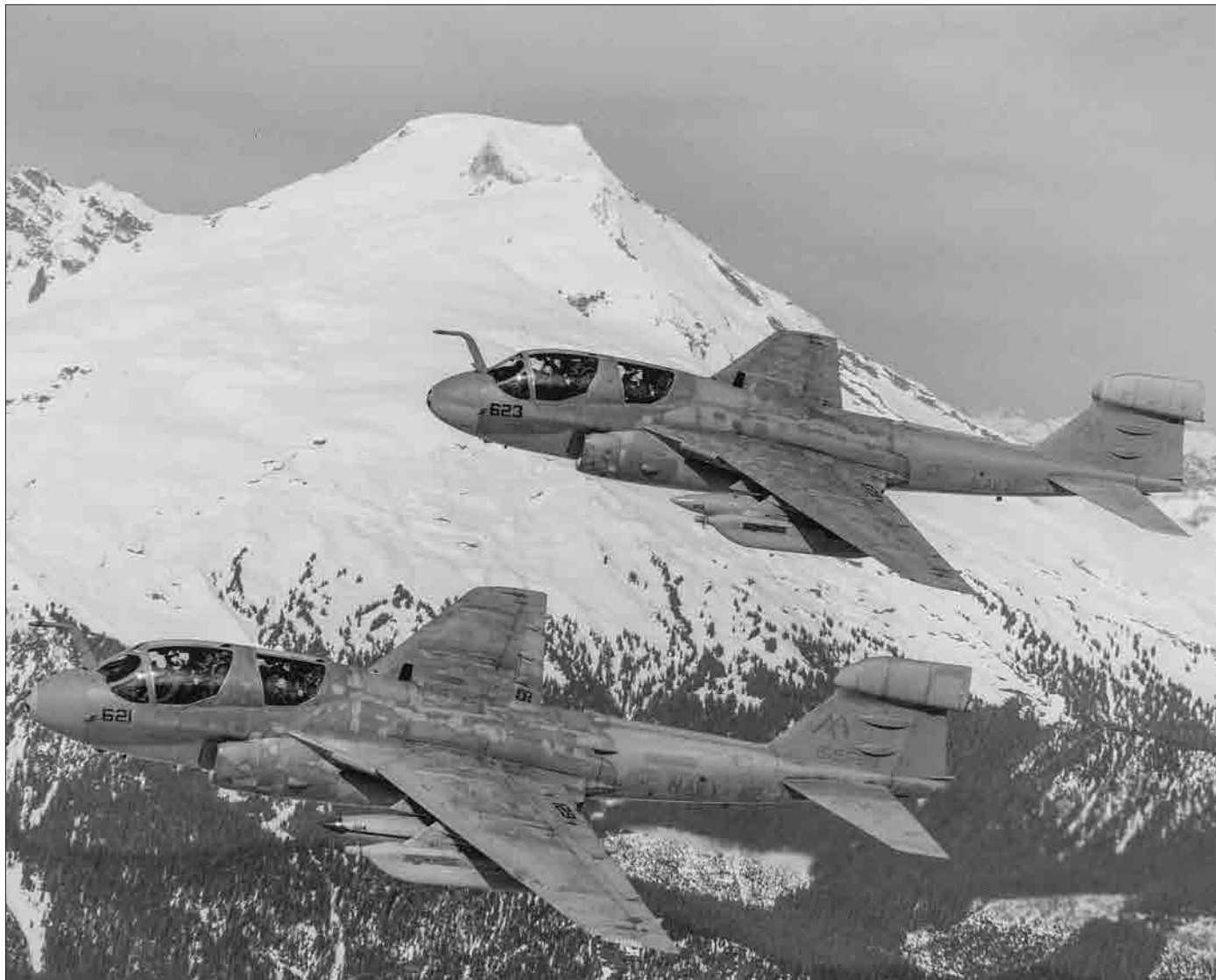
An older EA-6B Expanded Capability Prowler, BuNo 159586, leads a newer Improved Capability II version, BuNo 162934. Both are from VAQ-132, CVW-17, operating from NAS Whidbey Island, Wash., 1993.

years of service. Mariner's accomplishments included the first female naval aviator to fly tactical jet aircraft—A-4E Skyhawks and A-7E Corsair IIs—and to command an operational squadron, VAQ-34.