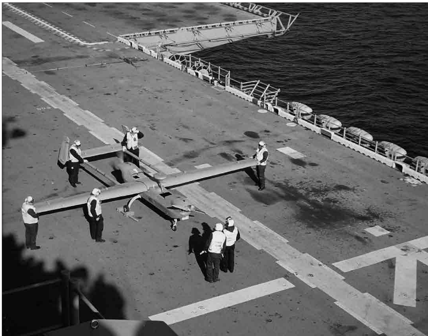
Sailors prepare a shipboard variant of the Army's RQ-5 Hunter for launch during testing on board amphibious assault ship Essex (LHD 2) in December 1993. Although the tests were positive and encouraging, the Navy did not purchase the RQ-5.

14 APRIL • Former President George H. W. Bush, his wife Barbara, two of their sons, and former Secretary of State James A. Baker III, arrived in Kuwait to participate in ceremonies commemorating the allied victory in the Persian Gulf War. The Kuwaitis arrested and charged 17 men with an attempt to assassinate the president and Kuwaiti Emir (Sheikh) al-Ahmed al-Jaber al-Sabah with a car bomb. On 29 April, the CIA reported that the bomb bore evidence of Iraqi origins. The plot heightened tensions in the region that resulted in additional coalition operations including patrols by naval aircraft.