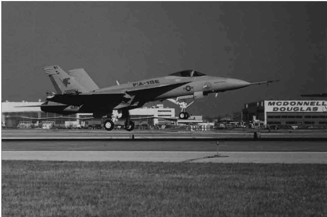
The first F/A-18E Super Hornet, designated E1, takes off on its maiden flight at St. Louis, Mo., 29 November 1995.

14 DECEMBER • The Bosnian Federation and the Bosnian Serbs signed the final Dayton Accords concerning Bosnia-Herzegovina, in Paris, France.