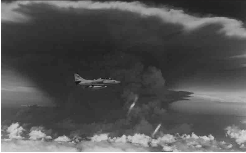
A TA-4J Skyhawk of VC-5 departs NAS Cubi Point, Philippines, during the eruption of Mount Pinatubo, June 1991.

British, French, and Turkish service members had been delivering relief supplies to the refugees. The Sixth Fleet's 24th Marine Expeditionary Unit commenced operations 17 hours after the arrival of the Marines at the Silopi, Iraq, humanitarian service support base. A similar forward base was also established at Diyarbakir, Turkey.