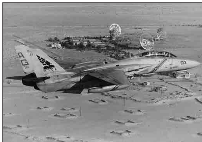
An F-14 Tomcat of VF-143, deployed on board Dwight D. Eisenhower (CVN 69), flies over a destroyed Iraqi radar site, c. 2000.

6 OCTOBER • President William J. Clinton visited Dwight D. Eisenhower (CVN 69). The ship provided national-level command and control for the chief executive during his visit.