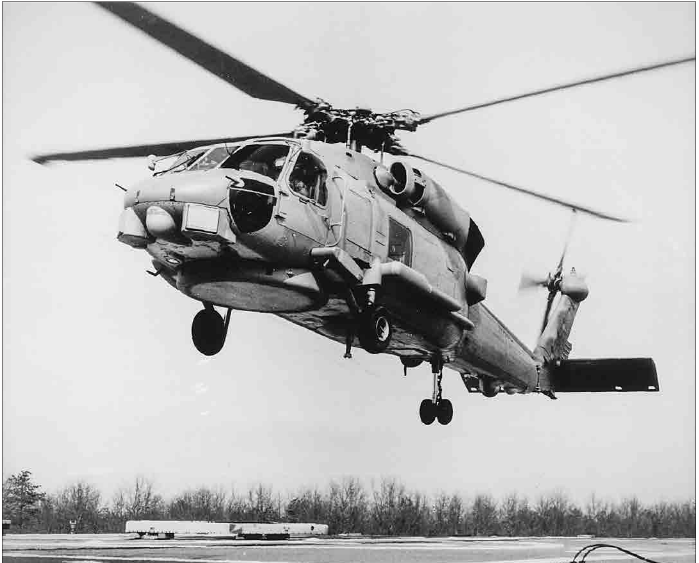
The Navy's SH-60B Seahawk is a sea-adapted version of the Army's UH-60 Black Hawk. The first production versions flew in February 1983.