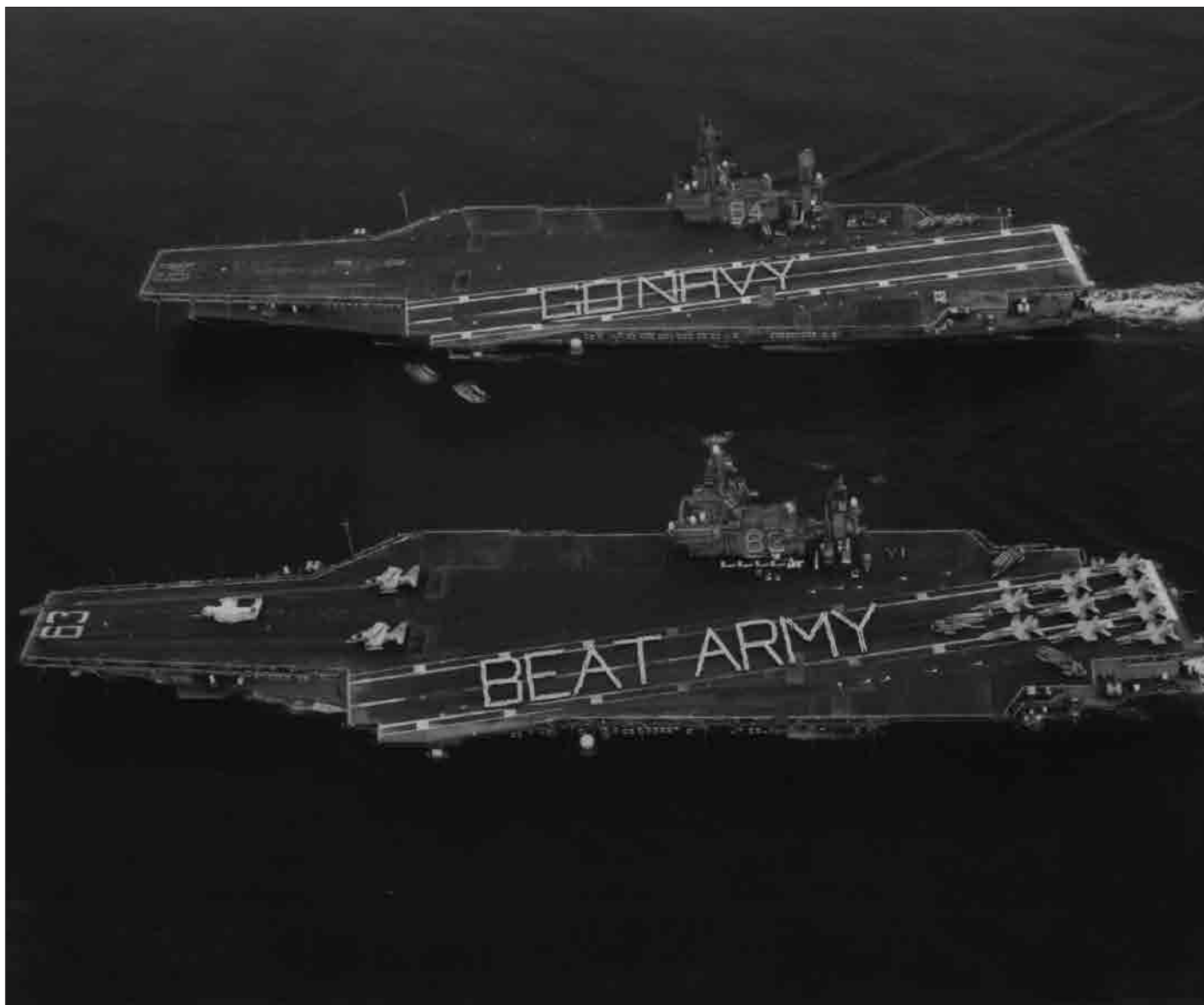
Crewmembers of Constellation (CV 64)—Go Navy—and Kitty Hawk (CV 63)—Beat Army—spell out their sentiments, 18 October 1995. Unfortunately, Army won 14–13.

Iraq for crimes against the Kurds. Enterprise sprinted from the Adriatic Sea and, on 19 September, arrived in the Red Sea.