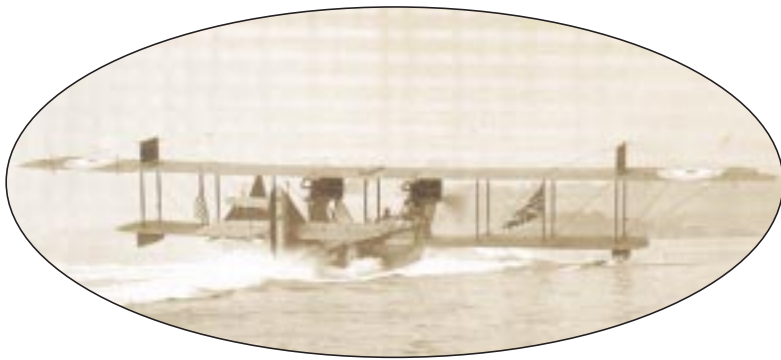
An F-5L (F2A) taking off at Felixstone, United Kingdom, circa 1918.