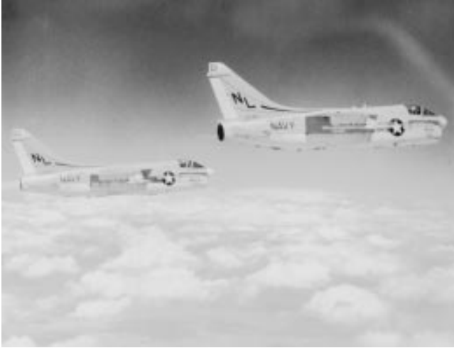
Two squadron A-7E Corsair IIs in flight, 1971.

on 12 May. Combat sorties were flown against targets at Ream Naval Facility, Kompong Som Naval Facility and a Cambodian patrol boat.