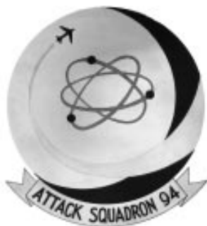
The squadron's second insignia used the atom symbol with electrons and a stylized aircraft, 1959.