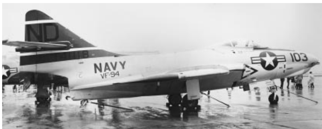
A squadron F9F-8B Cougar at NAS Moffett Field, California, June 1957.