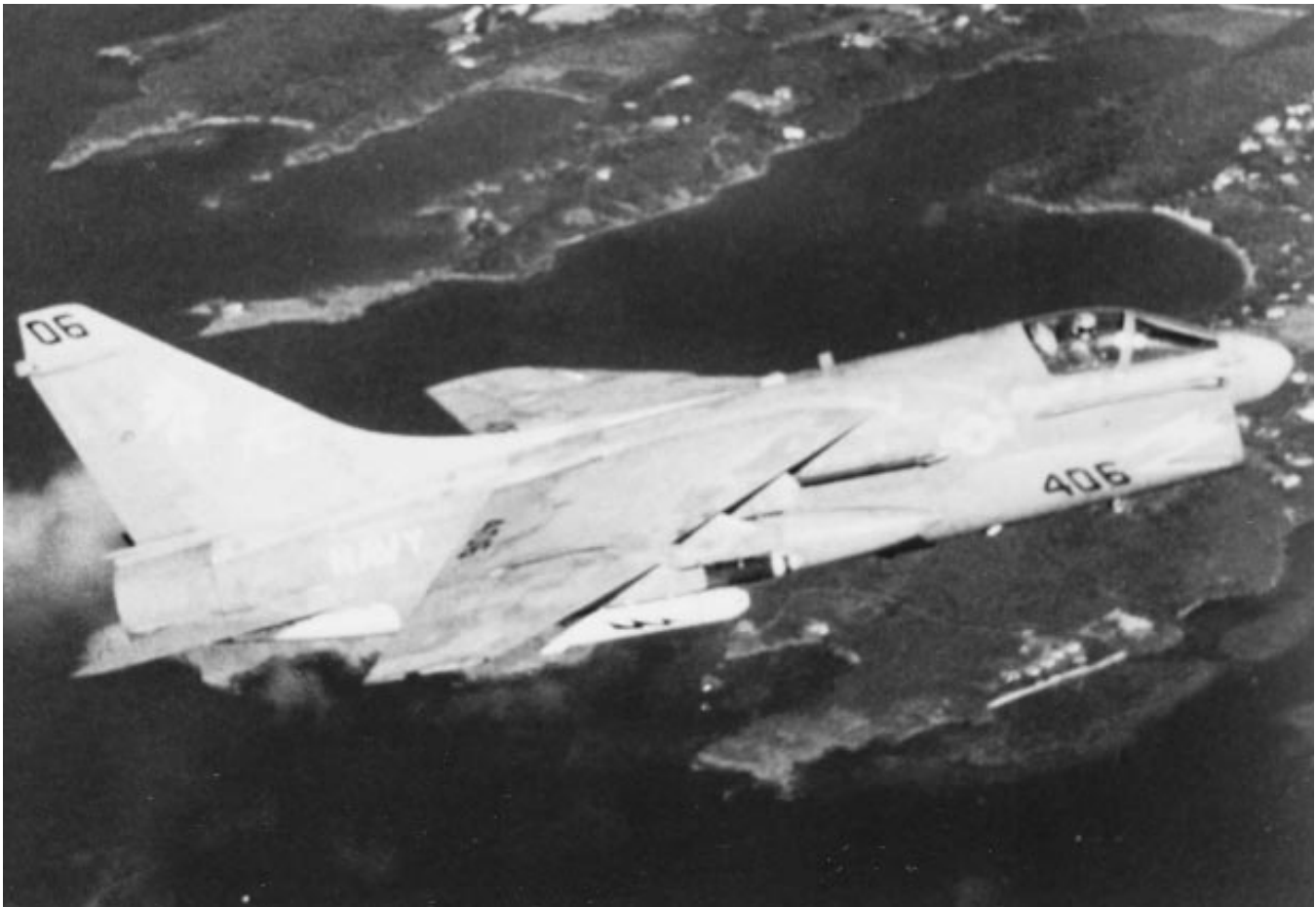
A squadron A-7E Corsair II with a low-visibility paint scheme, 1984.