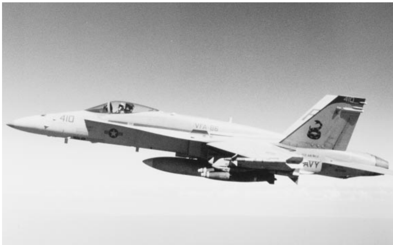
A squadron F/A-18C in flight, 1992.