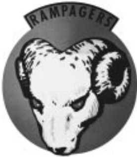
The squadron adopted the ram head insignia in 1957 and has used this design for the past four decades.

A new squadron insignia was approved by CNO on 12 April 1957. Colors for the Rampager insignia are: a light blue background outlined in gold; blue scroll outlined in black with black lettering; white ram's head with black markings; red eyes; and white horns with yellow, green and black markings.