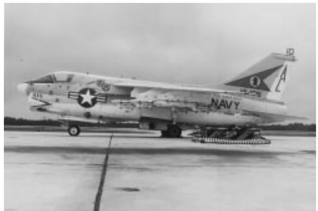
A squadron A-7E Corsair II in 1978.

Jul-Dec 1984: The squadron returned from a six-month deployment to MCAS Iwakuni in the western Pacific. It was assigned to MAG-12, 1st MAW. This was the first time a Navy squadron participated in the Marine Corps Unit Deployment Program and the first Navy squadron since World War II to come under the command of a Marine Corps officer. While deployed with the Marines the squadron's major mission was close air support.