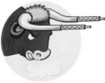
The squadron's first insignia, the bull with machine guns, was approved in 1950.

Redesignated Strike Fighter Squadron EIGHTY THREE (VFA-83) on 3 March 1988. The first squadron to be assigned the VA-83 and VFA-83 designations.