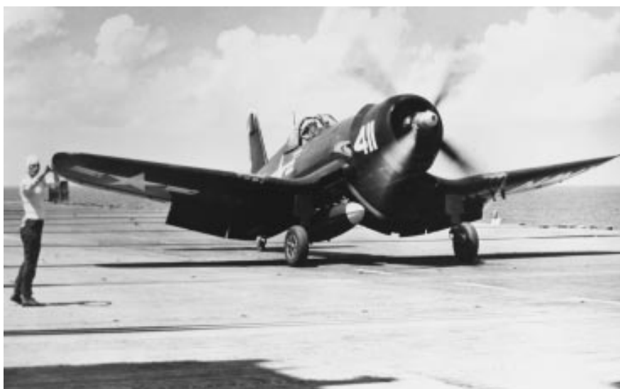
A squadron F4U-4 Corsair prepares to launch from Tarawa (CV 40), September 1951 (Courtesy Robert Lawson Collection).