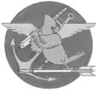
This was the first insignia approved for and used by the squadron.

Redesignated Strike Fighter Squadron EIGHTY SIX (VFA-86) on 15 July 1987. The second squadron to be assigned the VA-86 designation and the first squadron to be assigned the VFA-86 designation.