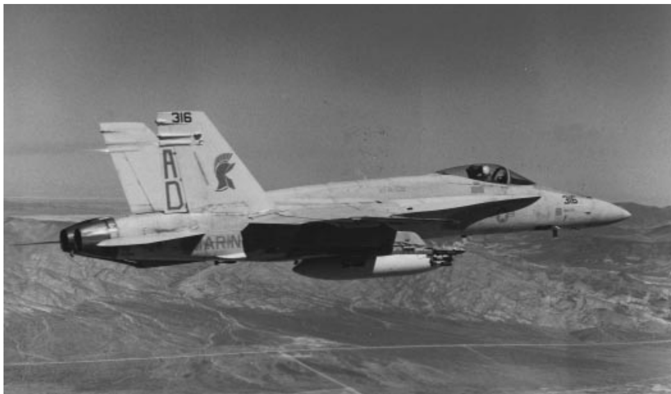
A squadron F/A-18A Hornet in flight, May 1987 (Courtesy Robert Lawson Collection).