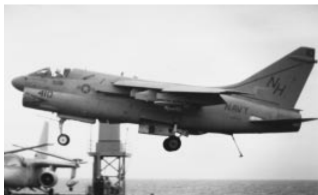
A squadron A-7E Corsair II, in a low-visibility paint scheme, preparing to trap aboard Enterprise (CVN 65) in 1989.

† CVG-9 was redesignated CVW-9 when Carrier Air Groups (CVG) were redesignated Carrier Air Wings (CVW) on 20 December 1963.