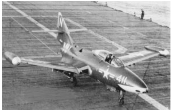
A squadron F9F-5 Panther on the deck of Hornet (CVA 12) during her world cruise in 1954.