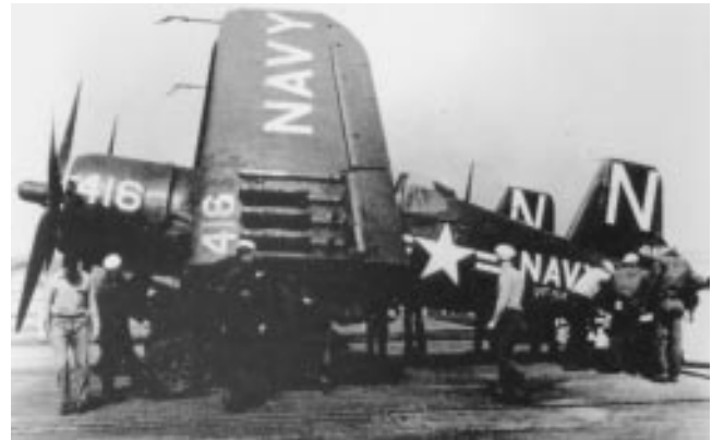
A squadron F4U-4 Corsair on the deck of Philippine Sea (CVA 47) during her deployment to Korea, 1952–1953.

Dec 1989: The squadron participated in Operation Classic Resolve, providing support for the Philippine government during a coup attempt.