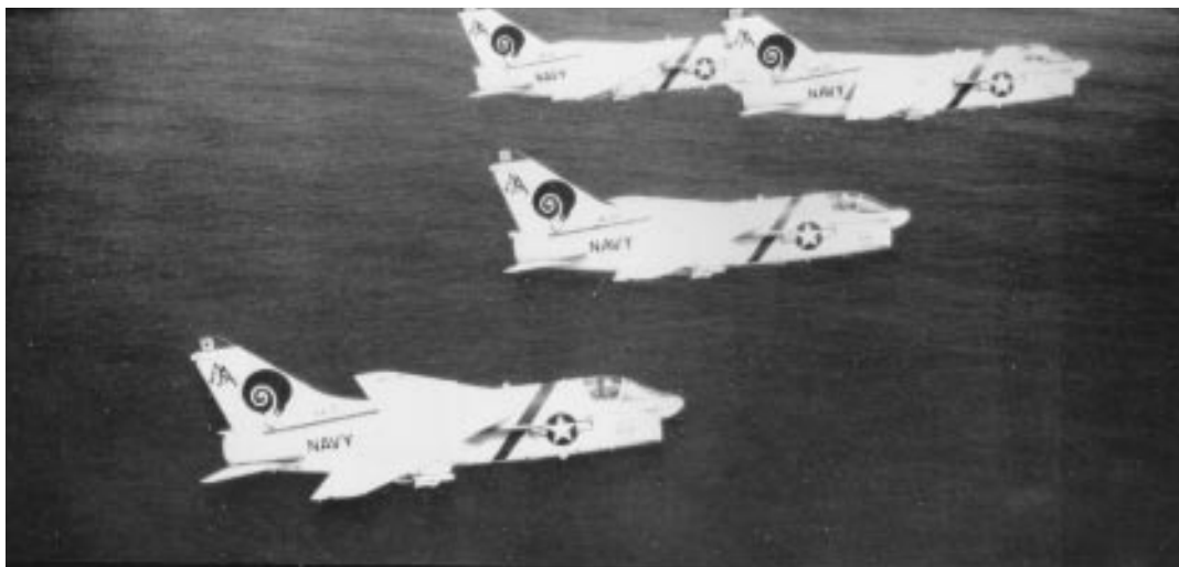
A formation of squadron A-7E Corsair IIs in flight during their deployment to the Med aboard Forrestal (CV 59) in 1974.