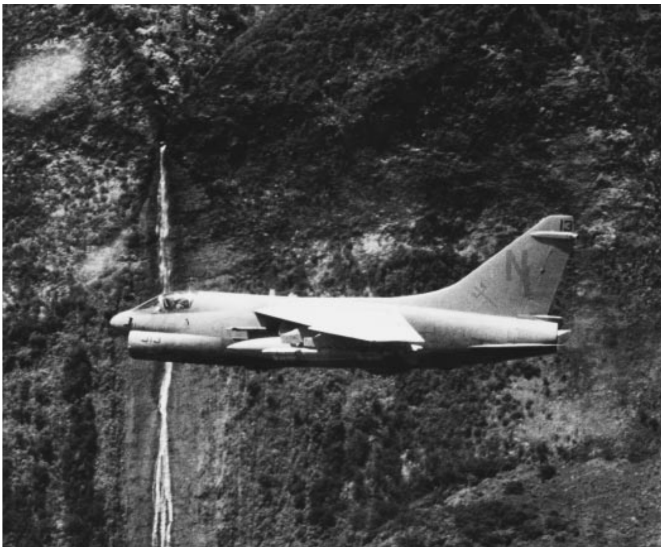
A squadron A-7E Corsair II in flight with its low-visibility paint scheme, 1984.