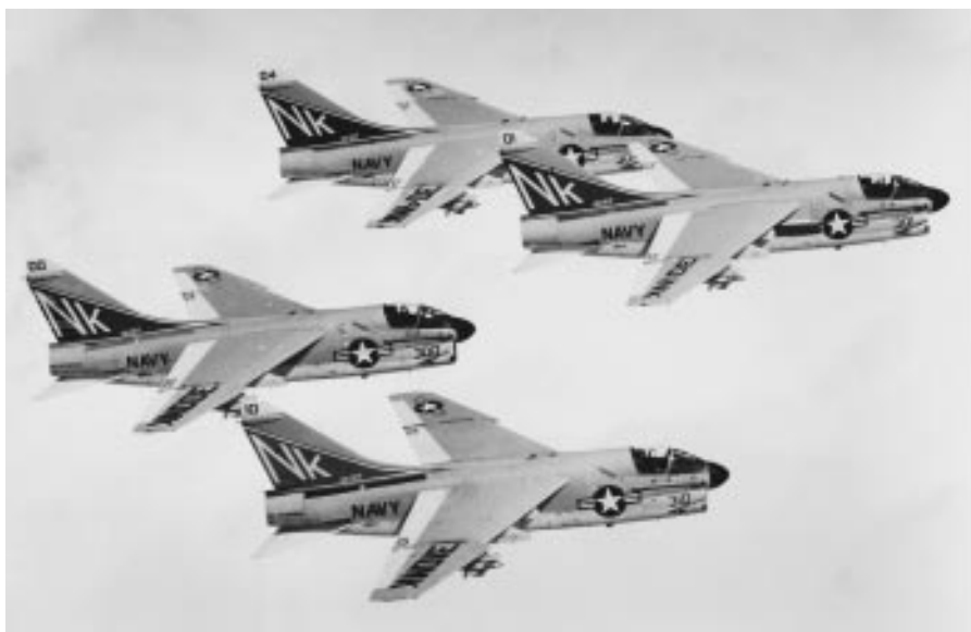
A formation of squadron A-7E Corsair IIs, 1975.

Jul 1988: During the Olympics in Seoul, Korea, Carl Vinson (CVN 70), with VA-97 embarked, operated off the coast of Korea.