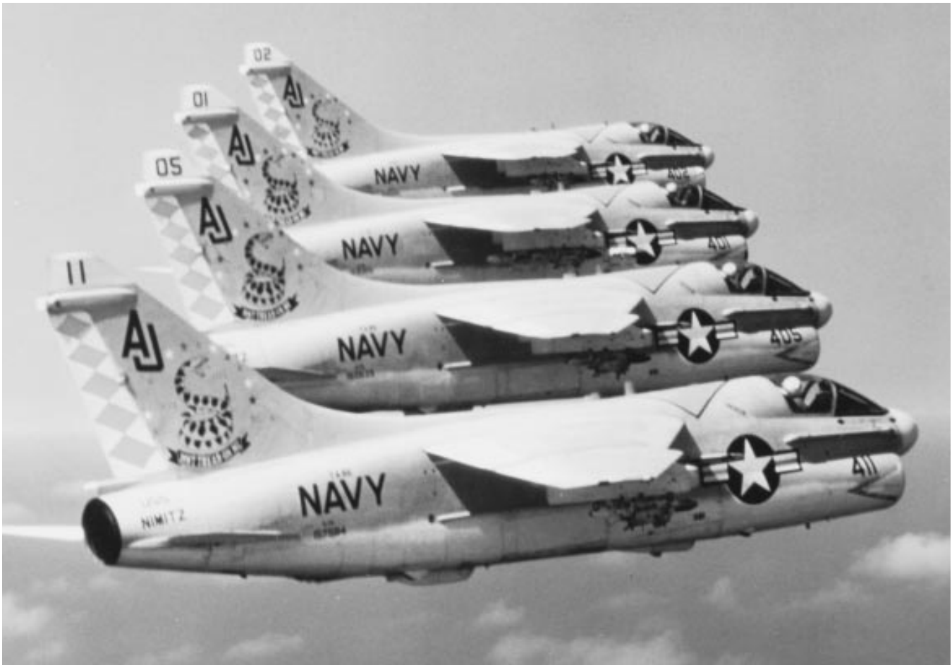
A formation of squadron A-7E Corsair IIs, circa 1978.

† CVG-7 was redesignated CVW-7 when Carrier Air Groups (CVG) were redesignated Carrier Air Wings (CVW) on 20 December 1963.