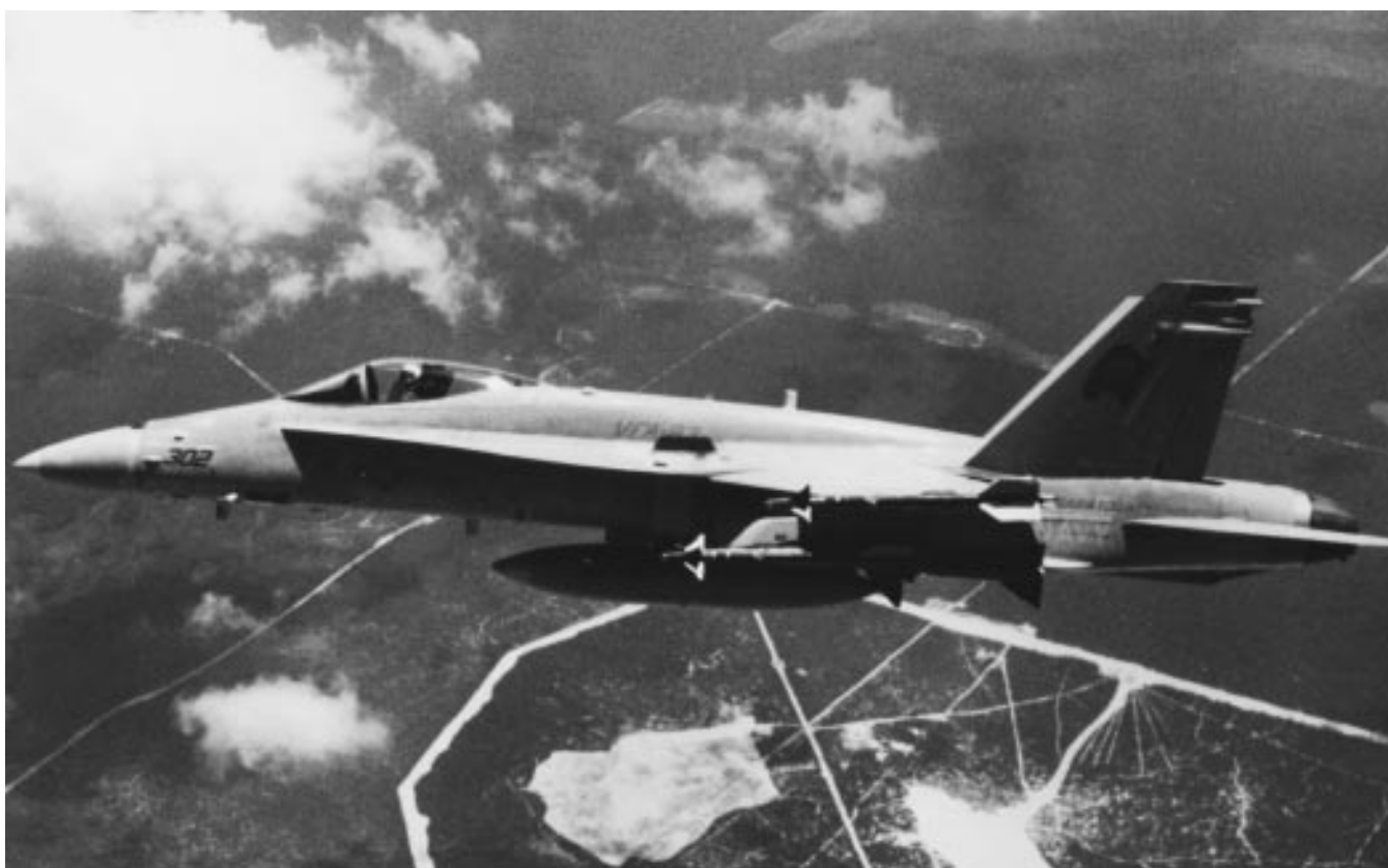
A squadron F/A-18C Hornet over the bombing range in Florida.