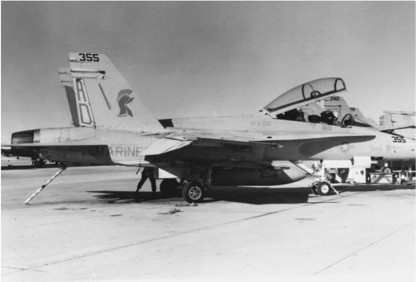
A squadron TF/A-18A Hornet at NAS Fallon, Nevada, March 1986.