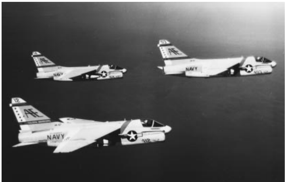
A flight of squadron A-7B Corsair IIs in 1971.

4 Dec 1983: In response to hostile fire against U.S. reconnaissance aircraft from Syrian positions in Lebanon, VA-87 aircraft participated in a coordinated strike against Syrian radar, communications and artillery positions overlooking the Multi-National Peacekeeping Forces. All squadron aircraft completed their mission and returned to the carrier.