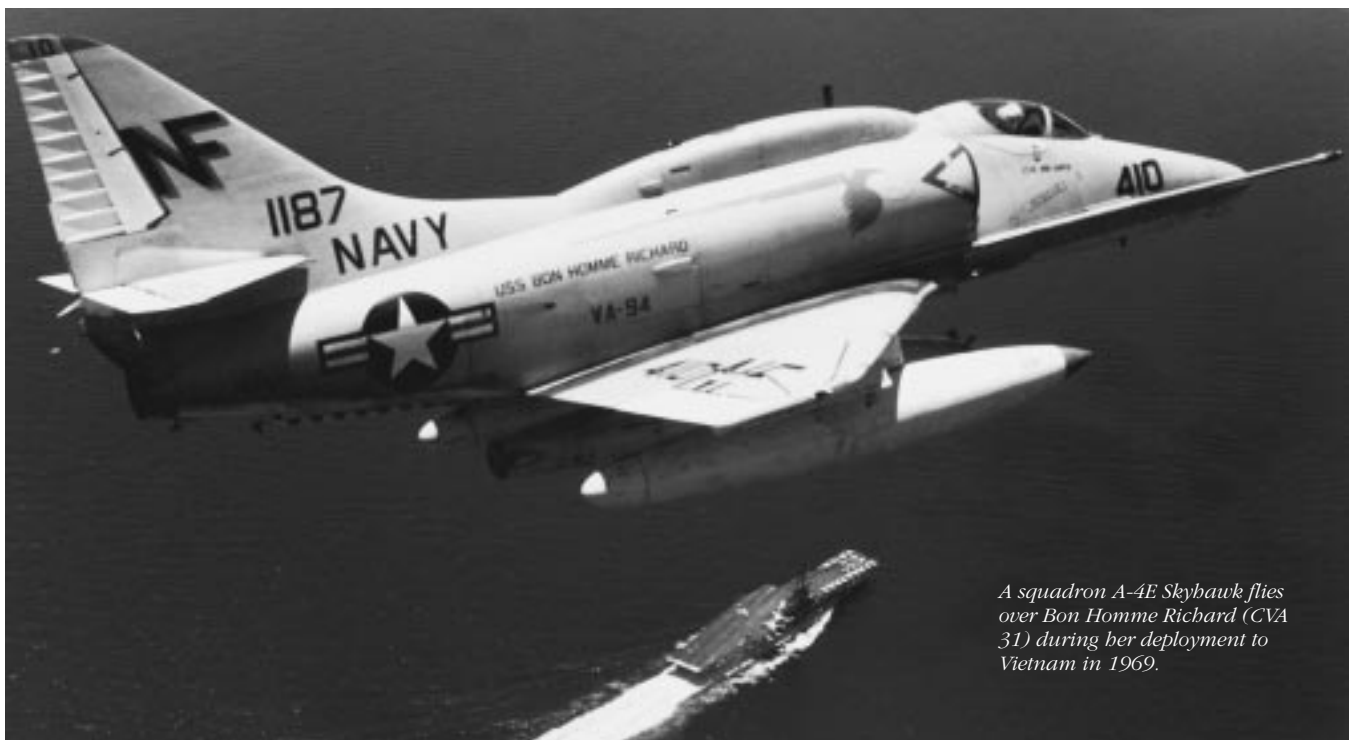
A squadron A-4E Skyhawk flies over Bon Homme Richard (CVA 31) during her deployment to Vietnam in 1969.