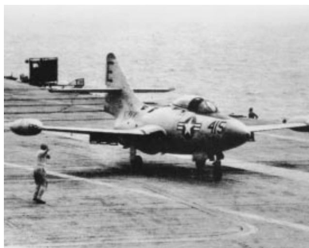
A squadron F9F-5 Panther on the deck of Antietam (CVA 36) during her cruise in 1953.