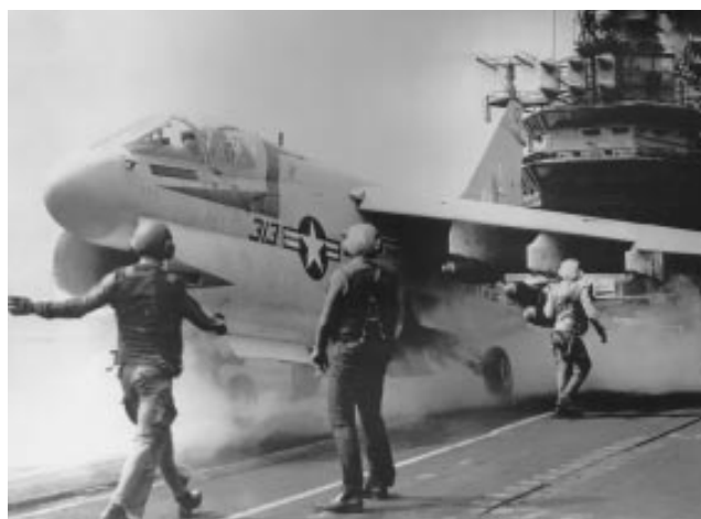
A squadron A-7A Corsair II preparing to launch from Coral Sea (CVA 43) while deployed to Vietnam in 1969.

12 Feb-7 Apr 1990: VFA-82 was embarked in Constellation (CV 64) during its transit from the west coast to the east coast via the Straits of Magellan.