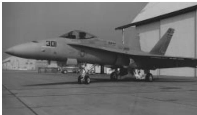
A squadron F/A-18A Hornet at NAS Lemoore, California, 1991.