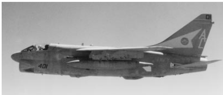
A squadron A-7E Corsair II in flight with low-visibility paint scheme, 1984.