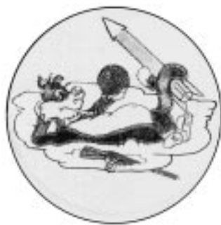
This cartoon cat insignia was used by the squadron prior to 1955 but was never officially approved.

When the squadron deployed aboard Hornet (CVA 12) during its world cruise in 1954 it was using a cartoon cat insignia. There is no record of this insignia being officially approved for use by the squadron.