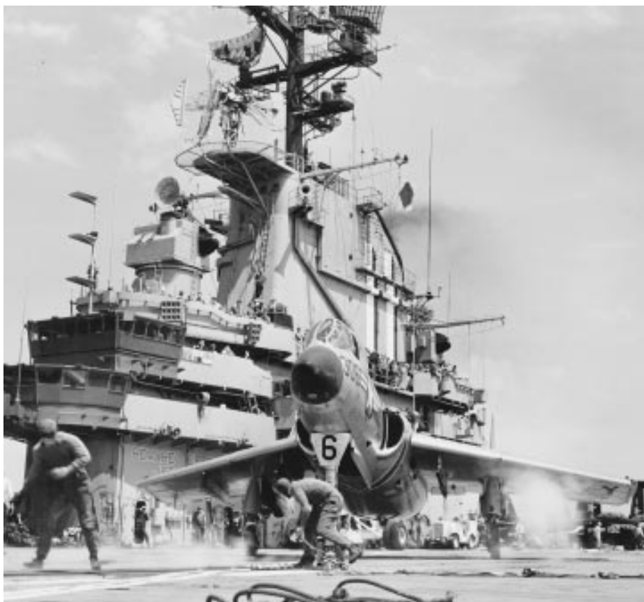
A squadron F7U-3M Cutlass preparing for a launch from Intrepid (CVA 11) in 1956.