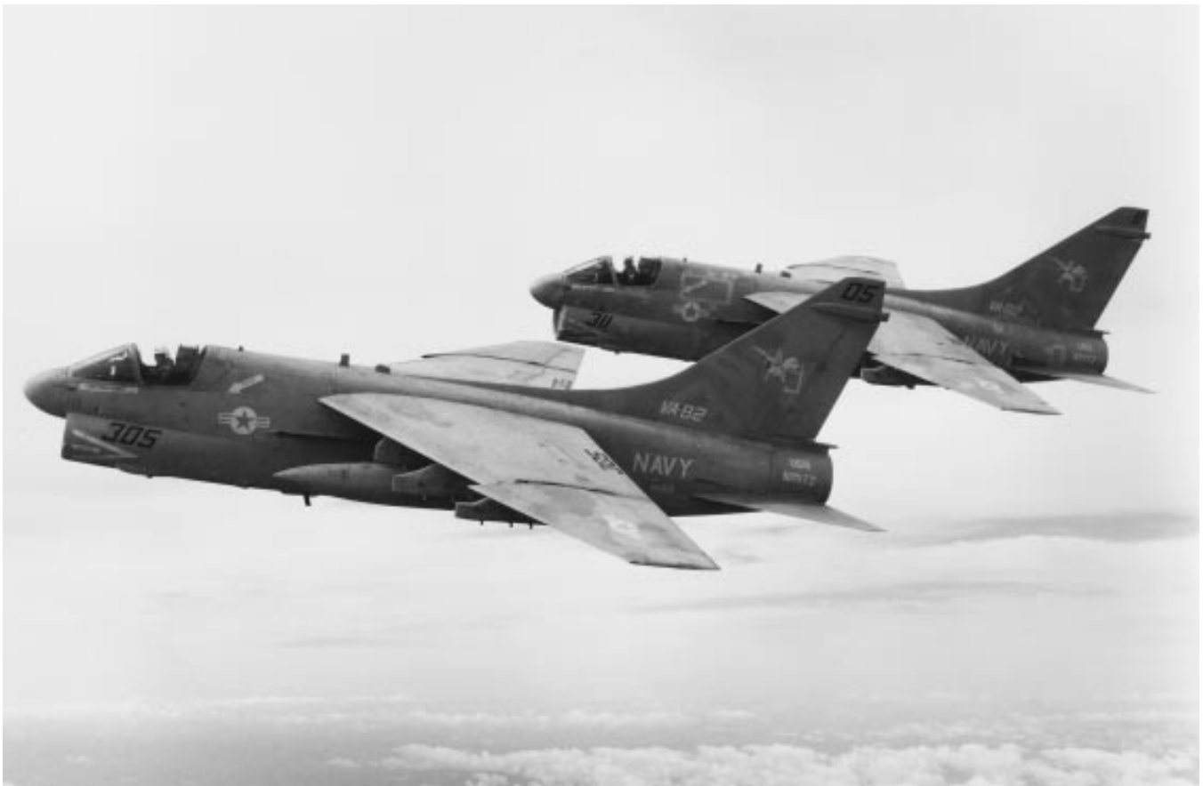
Two squadron A-7E Corsair IIs in flight, showing the low-visibility paint scheme, 1987.