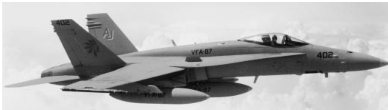
A squadron F/A-18C Hornet in flight, 1991.