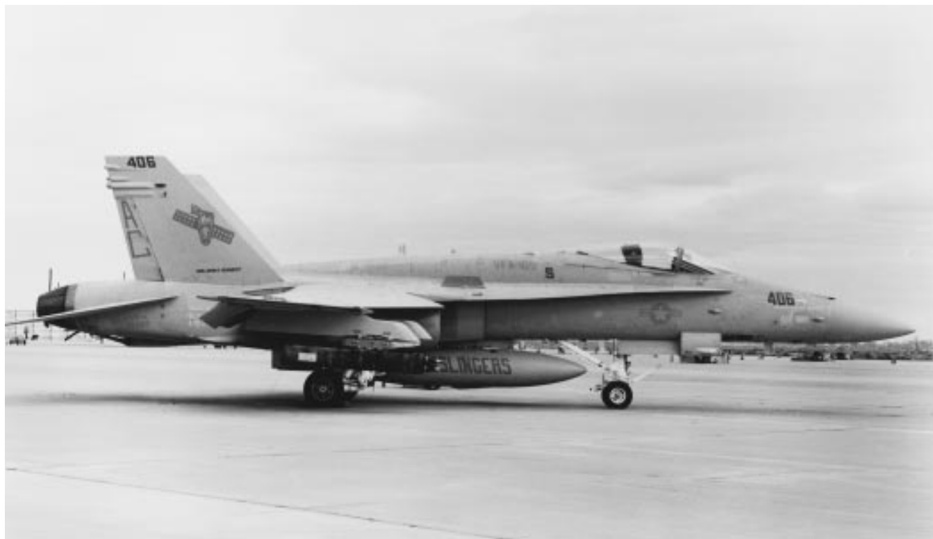
A squadron F/A-18C Hornet at NAS Fallon, Nevada, March 1992.