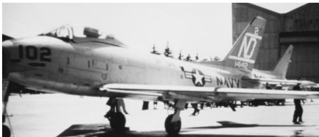
A squadron FJ-3M Fury, circa 1958.