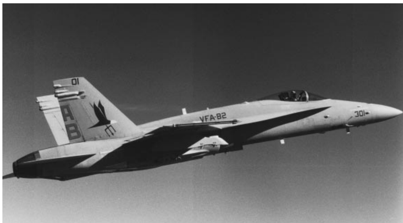
A squadron F/A-18C Hornet in flight, 1987.