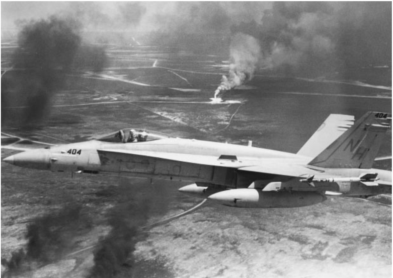
A squadron F/A-18C Hornet flies over the burning oil fields of Kuwait, 1991.